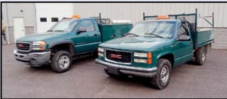
'03 GMC 2500 AND '98 GMC 3500

1998 GMC Model 3500SLE Flatbed Truck , powered by Vortec 5.7L gas engine and automatic transmission, equipped with 8'6" flatbed with Reading side boxes, stake pockets, material rack, tow package with electric, air conditioning, power windows, locks and mirrors, and LT245/75R16 tires. In good condition with good tires.