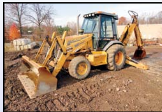
'99 CASE 590 SUPER L 4X4 EXTEND-A-HOE

1999 CASE Model 590 Super L Series II, 4x4 Tractor Loader Extend-A-Hoe , s/n JJG0211911, powered by Case diesel engine and shuttle transmission, equipped with general purpose loader bucket, 24" digging bucket, hydraulic beyond, 4-lever backhoe controls, enclosed ROPS cab, 14x17.5 NHS front and 21Lx24 rear tires. In good condition with fair to good tires.