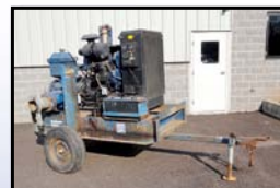
GORMAN RUPP 6X6 DRI-PRIME

GORMAN RUPP Model Prime Aire 6x6 Portable Dri-Prime Pump , powered by John Deere Powertech 4.5L diesel engine, equipped with PA Series 6x6 model PA6A60-4045D centrifugal pump, s/n 1110032. In good condition. (Tach Meter Reads 4,446 Hours) (Hobbs Meter Reads 4,918 Hours) HONDA WT40X, 4" Trash Pump • (3) HONDA WT30X, 3" Trash Pumps • (2) HONDA WT20X, 2" Trash Pumps • GOULD 2" Submersible Raw Sewage Pump • (4) TSURUMI 2" Electric Submersible Pumps • (2) 1" Submersible Pumps • 2"-6" Suction & Discharge Hose • POWERPRO 3500 Watt Generator • UST 2300 Watt Generator • (5) 50 Gallon Skid Mounted Fuel Tanks-(2) with containment • 50 Gallon Transfer Tanks, with pumps • Pickup Step Fuel Tanks, with 12 volt pumps