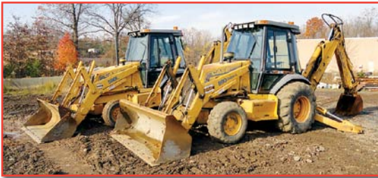
(2) OF (3) CASE BACKHOES

Hatfield, Pennsylvania (30 Miles North of Philadelphia)