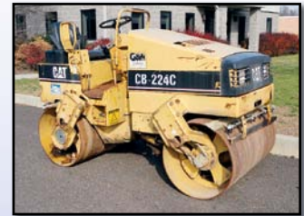
'96 CAT CB224C

1996 MAULDEN Model 550E Crawler Paver , s/n 55-9604-112, powered by Kohler 23HP twin cylinder gas engine and hydraulic drive, equipped with 8'-13" heated vibratory screed with crown adjustment, tilt hopper feed, and diesel spray down. In fair to good condition with good undercarriage.