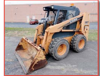
(1) OF (2) SKID STEER LOADERS