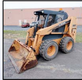
'02 CASE 70XT

Case diesel engine and hydrostatic transmission, equipped with hi-flow hydraulics, 72" general purpose bucket (fair), ROPS canopy, and 12x16.5NHS tires. In good condition with good to very good tires. (02,639 Hours)