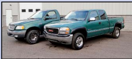
'99 GMC AND '99 FORD 4X4 PICKUPS

1999 GMC Model 2500 SLT, 4x4 Extended Cab Pickup Truck , powered by Vortec 6.0L gas engine and automatic transmission, equipped with 6'6" bed with liner, tow package with electric, air conditioning, full power package, and LT245/75R16 tires. In good condition with good tires.