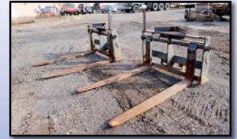
ACS 72" FORK ATTACHMENTS

Miscellaneous Equipment Attachments: (2 Sets) ACS 72" Forks (Loader) • 60" Forks (Bar Mount) • (2 Sets) 48" Forks (Bolt-On)