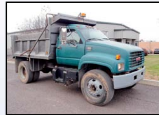
'98 GMC C6500

1998 GMC Model C6500 Single Axle Dump Truck , powered by Cat 3126, 330HP diesel engine and Thiele 10' steel dump body with manual tarp and (3) chutes, tow package with electric, electric/hydraulic brakes, 25,950# GVWR, air conditioning, heated mirrors, and 11R22.5 tires. In good condition with good tires. 2003 GMC Model 2500HD Utility Truck , powered by Vortec 6.0L gas engine and automatic transmission, equipped with Reading 8' open utility body, tow package with electric, air conditioning, and LT245/75R16 tires. In good condition with good tires.