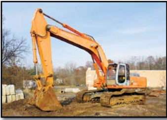
'99 HITACHI EX330 LC

1999 HITACHI Model EX160 LC-5 Hydraulic Excavator , s/n 13KP001986, powered by Isuzu diesel engine and hydraulic drive, equipped with 8'6" dipper stick, hydraulic beyond, CF 24" digging bucket, air conditioning, vandalism kit, 12'8" crawlers, and 23.5" TGB pads. In good condition with good undercarriage.