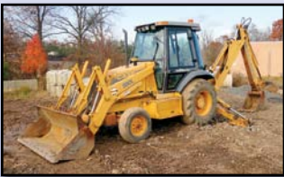
'97 CASE 580L EXTEND-A-HOE

(Case 590) • Bolt-On Thumb Attachment • 12" Asphalt Cutter • Backhoe Digging Buckets: CAT: 24"; 12" • CASE: 36"; 24"; 12"