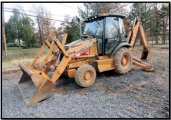
'02 CASE 580 SUPER M 4X4 EXTEND-A-HOE

1999 CASE Model 590 Super L Series II, 4x4 Tractor Loader Extend-A-Hoe , s/n JJG0211911, powered by Case diesel engine and shuttle transmission, equipped with general purpose loader bucket, 24" digging bucket, hydraulic beyond, 4-lever backhoe controls, enclosed ROPS cab, 14x17.5 NHS front and 21Lx24 rear tires. In good condition with fair to good tires.