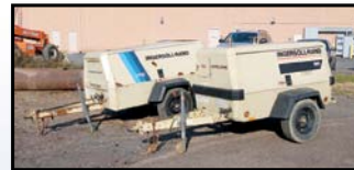
'01 AND '95 IR COMPRESSORS

TARGET Model Pro651I Concrete Saw , powered by Wisconsin 65HP gas engine and hydrostatic transmission, equipped with 48" blade capacity. Skid Mounted Straw Blower , s/n 55598418, powered by Honda 20HP motor with electric start, equipped with rotating chute and feed table 2001 SOLAR TECH Model AB-0715-D Solar Powered Portable Arrowboard . In very good condition. PROTECT-O-FLASH Solar Powered Portable Arrowboard . In good condition.