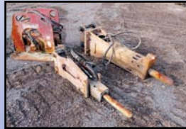
DEMO HAMMERS AND PLATE COMPACTOR

1989 CATERPILLAR Model 225B LC Hydraulic Excavator , s/n 2ZD01690, powered by Cat 3208 diesel engine and hydraulic drive, equipped with 10' dipper stick, hydraulic beyond, 30" digging bucket, 14'6" crawlers, and 30" TGB pads. In good condition with fair to good undercarriage.