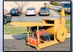
TAILGATE STRAW BLOWER

2001 INGERSOLL RAND Model P-185-JD, 185CFM Portable Air Compressor , s/n 317694UKK221, powered by John Deere diesel engine. In good to very good condition. 1995 INGERSOLL RAND Model P175WJD, 175CFM Portable Air Compressor , s/n 251434UKF282, powered by John Deere diesel engine. In good condition.