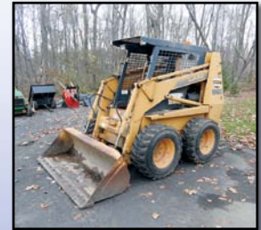
'99 CASE 1845C HI-FLOW

Skid Steer Attachments: ALLIED 715 Hydraulic Demolition Hammer • GEHL 16" Cold Planer • PREPARATOR 72" Soil Conditioner • (2) FFC 72" Broom Attachments • (2) GUEST 41"-72" Utility Trench Paver