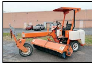
'06 LAYMOR 8HC

1996 MAULDEN Model 550E Crawler Paver , s/n 55-9604-112, powered by Kohler 23HP twin cylinder gas engine and hydraulic drive, equipped with 8'-13" heated vibratory screed with crown adjustment, tilt hopper feed, and diesel spray down. In fair to good condition with good undercarriage.