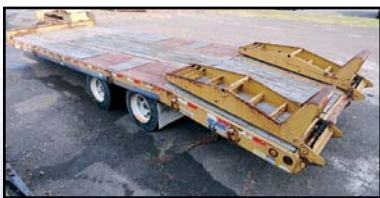
'06 EAGER BEAVER 20 TON

Trailer , equipped with 12'x6'6" level deck, 3' beavertail, ramps, electric brakes, 12,800# GVWR, and 9-14.5 tires. In fair to good condition with good tires. 1985 INTERSTATE Model 18BST, 9 Ton Tri-Axle Tag-A-Long Trailer , equipped with 16'6"x8' level deck, 3'6" beavertail, ramps, 22,975# GVWR, and 9.50-16.5 tires. In fair condition with good tires. 2003 PREMIER Tandem Axle Landscape Trailer , equipped with 7,000# GVWR