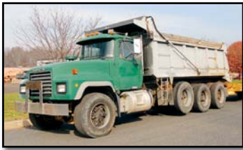
'97 MACK RD688S

1998 GMC Model C6500 Single Axle Dump Truck , powered by Cat 3126, 330HP diesel engine and Thiele 10' steel dump body with manual tarp and (3) chutes, tow package with electric, electric/hydraulic brakes, 25,950# GVWR, air conditioning, heated mirrors, and 11R22.5 tires. In good condition with good tires. 2003 GMC Model 2500HD Utility Truck , powered by Vortec 6.0L gas engine and automatic transmission, equipped with Reading 8' open utility body, tow package with electric, air conditioning, and LT245/75R16 tires. In good condition with good tires.