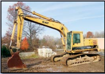
'89 CAT 225B LC

1999 HITACHI Model EX160 LC-5 Hydraulic Excavator , s/n 13KP001986, powered by Isuzu diesel engine and hydraulic drive, equipped with 8'6" dipper stick, hydraulic beyond, CF 24" digging bucket, air conditioning, vandalism kit, 12'8" crawlers, and 23.5" TGB pads. In good condition with good undercarriage.