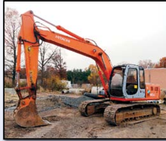
'99 HITACHI EX160 LC

1999 HITACHI Model EX330 LC-5 Hydraulic Excavator , s/n 1H1P020839, powered by Isuzu diesel engine and hydraulic drive, equipped with 10'6" dipper stick, CF 30" digging bucket, air conditioning, vandalism kit, 16'4" crawlers, and 31.5" TGB pads. In good condition with good undercarriage.