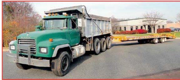
'97 MACK AND '06 EAGER BEAVER 20 TON