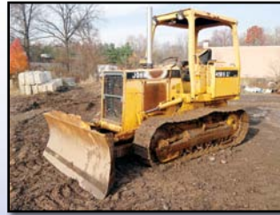
'96 JOHN DEERE 450G LT

Miscellaneous Equipment Attachments: (2 Sets) ACS 72" Forks (Loader) • 60" Forks (Bar Mount) • (2 Sets) 48" Forks (Bolt-On)