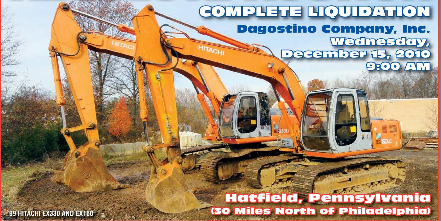
'99 HITACHI EX330 AND EX160

Hatfield, Pennsylvania (30 Miles North of Philadelphia)