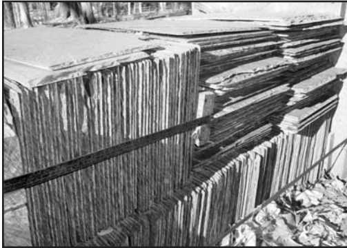
28 SQUARE 1/4" SLATE ROOFING

PRE-SORTED FIRST CLASS MAIL US POSTAGE PAID HAVERTOWN, PA PERMIT #45