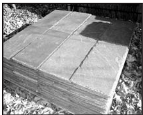
28 SQUARE 1/4 INCH SLATE ROOFING

(10 Pallet Boxes) Pennsylvania Native Gray, 1/4" Slate Shingles , predrilled, 10"x20" tiles. (2.75 to 2.9 Square Per Box) (Approximately 28 Square Total)