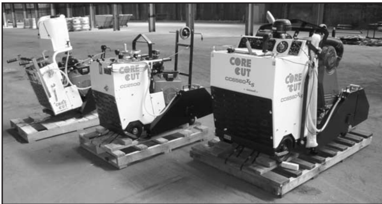
(3) OF (5) UNUSED CONCRETE SAWS