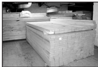
15,000+/- LF FRAMING LUMBER

Framing Lumber , (275) 2x4x10' • (300) 2x4x8' • (65) 2x8x12' • (175) 2x10x14' • (200) 2x10x16' • (100) 2x12x20' • (100) 2x12x24' (15 to 20 Skids) PERGO Laminate Wood Flooring (Various Styles and Colors)