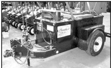
07 PANTHER P-195 PUMPER KETTLE