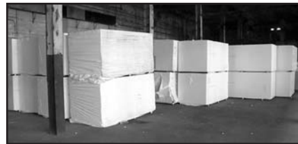
GENFLEX POLY ISO INSULATION

(36 Bundles) GENFLEX Poly Iso Insulation , 4x8x1.5" (32 Sheets/1,024 SF Per Bundle) • (92 Rolls) POLYGLASS Polyflex 4mm Summer Modified Bitumen • (60 Rolls) DEWITTS Pro Cotton Membrane , 4" • (40 Rolls) DEWITTS Roof Shield 67 Ice and Water Underlayment , 36"x66' • (270 5-Gallon Pails) GENFLEX 10076 Bonding Adhesive (For Use With EPDM and TPO Roofing) • (144 5-Gallon Pails) DEWITTS Xtra ProFlash Rubberized Cement • (58 5-Gallon Pails) ALCM Wet/Dry Roof Cement (Winter Grade) • (36 5-Gallon Pails) NEOSEAL Neoprene Cement • (36 5-Gallon Pails) HARVEY Water Based Acrylic Roofing Adhesive • (18 5-Gallon Pails) ALCM Roof Cement (Rubberized) • GENFLEX Peel and Stick Flashing • (8 Boxes) 12"x12"x.024 Wind Lock Soffit, Vented and Non-Vented (16 Pieces Per Box) • (50+/-) 4"x5"x10' .024 White Aluminum Downspouts • Downspouts Elbows • (10 Rolls) 15# Roofing Felt • Galvanized Roof Decking • Roof Drains • LARGE ASSORTMENT 2" - 12" Screws • LARGE ASSORTMENT 2" and 3" Barbed Steel Hold Down Plates