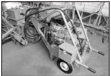
ASE 2,000# ROOF HOIST

ASE 2,000# Hydraulic Roof Hoist , s/n 20SL-1207, Honda 20HP gas, e/w hydraulic single line winch and (38) 50# counterweights