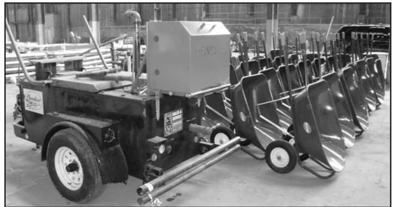
'07 PANTHER PUMPER KETTLE