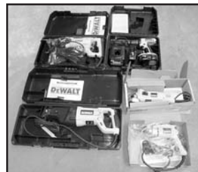
ASSORTED POWER TOOLS

MILLER Thunderbolt 225 Amp Stick Welder , 230 volt • WINCO 10,000 Watt Portable Generator , Honda 20HP (12 Hours) • GENERAC 10,000 Watt Portable Generator , Robin 18HP • POWERMATE 3,250 Watt Portable Generator , Briggs and Stratton 6HP • Gas Powered Demolition Saw • DEWALT Portable Air Compressor , Honda 8HP • DEWALT 12" Compound Miter Saw • (3) UNUSED DEWALT BW311K Reciprocating Saws • (4) UNUSED DEWALT D25213K, 1" SDS Rotary Hammers • (3) UNUSED DEWALT DC720KA, 1/2" Cordless Drills , 10 volt • (10) UNUSED DEWALT DW268 HD Screw Shooters , versa clutch • (5) UNUSED DEWALT D28110, 4" Angle Grinders • (3) DEWALT Coil Roofing Nailers • LARGE QUANTITY Masonry Drill Bits and Assorted Hardware • (50 5-Gallon Pails) DEWITTS DS6000 Driveway Sealer • (2 Skids) Shrink Wrap