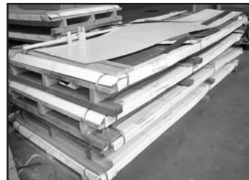
ASSORTED SHEET METAL

WILDER LD2051 Slitter , 3-Cut, 24 Gauge • TENNSMITH 10' Floor Hand Brake , 14 Gauge • CONNECTICUT 4' Bench Top Hand Brake , 22 Gauge • 10' Portable Aluminum Hand Brake (21 Bundles) MCELROY 4'x10'x24 Gauge Sheet Metal , Medium Bronze (50 Sheets Per Bundle) (1,050 Sheets Total) • (5 Bundles) MCELROY 4'x10'x24 Gauge Sheet Metal , Dark Bronze (50 Sheets Per Bundle) (250 Sheets Total)