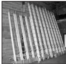
ASSORTED UNUSED LADDERS

WERNER 2320, 20'x12" Aluminum Pick Board , 500# • WERNER Ladder Jacks