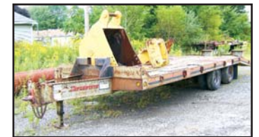
92 Interstate 10 Ton

1996 INGERSOLL-RAND Model L6-4MH Portable Light Plant , s/n 266802UFG823, powered by Kubota 3 cylinder diesel engine, equipped with Leroy Somer 6KW generator, (4) lights, manual raise, (2) stabilizers, and 185/80R13 tires. In fair to good condition with good tires. (Not Running) GORMAN RUPP 4" Portable Centrifugal Pump , s/n Unknown, powered by Detroit 3-71 diesel engine, equipped with 215/75R15 tires. In fair to good condition with fair to good tires.