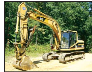
'00 CAT 315BL