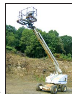
97 Marklift CH60C

1997 MARKLIFT Model CH60C, 60' Self Propelled 4x4 Aerial Lift , s/n 7614, powered by Cummins 4B3.9-C diesel engine and hydraulic drive, equipped with 60' platform height, 51' horizontal reach, 3-section hydraulic boom, 3'x6' 600# capacity man/material basket, basket tilt and rotation, upper and lower controls, 110 volt power to platform plug, hydraulic leveling, and 15x19.5 tires. In good condition with good tires.