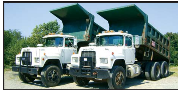
'89 MACK RD690SX