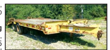
70 Rogers 20 Ton