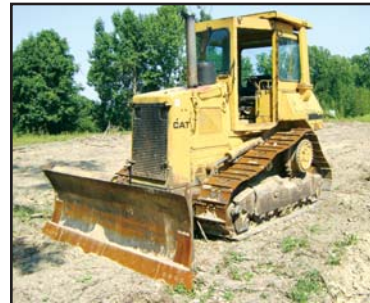
87 Cat D4H