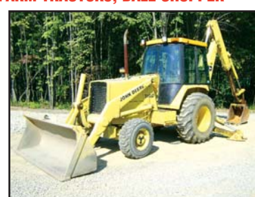
90 John Deere 310C 4x4

1992 JOHN DEERE Model 4255E, 4x4 Farm Tractor , s/n RW4255E011145, powered by John Deere 6 cylinder, 123HP diesel engine and 15 speed powershift transmission, equipped with 3-point hitch, PTO, (3) hydraulic outlets, front pocketbook counterweight holder, dual rear wheels, tow bar, enclosed ROPS cab with air conditioning and light package, 16.9R28 front and 20.8x38 rear tires. In good condition with fair to good tires. (Dual Wheel Package Sold Separately)