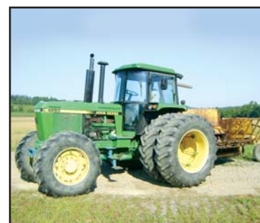
92 JD 4255E & Vermeer Bale Chopper

1990 JOHN DEERE Model 310C, 4x4 Tractor Loader Extend-A-Hoe , s/n T0310CF764069, powered by John Deere 4 cylinder diesel engine and shuttle transmission, equipped with 24" digging bucket, general purpose loader bucket with bolt-on cutting edge, Wain Roy manual quick disconnect, enclosed ROPS cab with light package, 12x16.5 front and 19.5Lx24 rear tires. In good condition with fair to good tires.