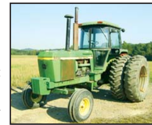
John Deere 4430H

JOHN DEERE Model 4430H Farm Tractor , s/n 005050R, powered by John Deere 6 cylinder, 125HP diesel engine and 4 speed quad range transmission, equipped with 3-point hitch, PTO, dual hydraulic outlets, manual extendable front axle, tow bar, (6) front pocketbook counterweights, dual rear wheels, enclosed ROPS cab with air conditioning and light package, 10.00x16 front and 18.4x38 rear tires. In good condition with good to very good tires. (Dual Wheel Package Sold Separately)