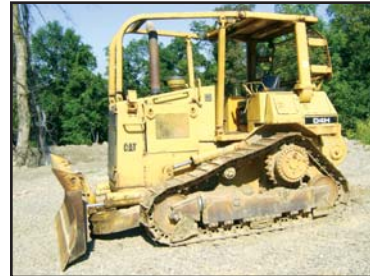
88 Cat D4H