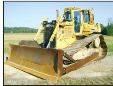
93 Cat D6H LGP II