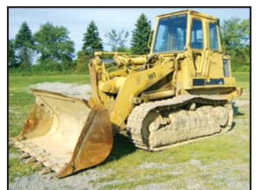
90 Cat 963

1987 CATERPILLAR Model D8L Crawler Tractor , s/n 53Y04715, powered by Cat 3408 diesel engine and powershift transmission, equipped with semi-U blade with tilt, 2-barrel multi-shank ripper with 1 shank, ROPS over enclosed cab with air conditioning and light package, and 24" SBG pads. In good condition with good to very good undercarriage.