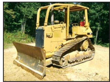
89 Cat D4H