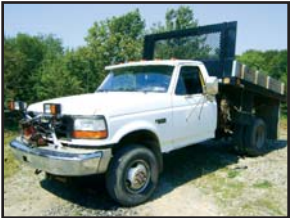
93 Ford F350XL 4x4

1993 FORD Model F-350XL, 4x4 Flatbed Dump Truck , powered by 8 cylinder gas engine and automatic transmission, equipped with Knapheide model PVMXS-93C, 9'3" steel flat dump body, s/n 934823-2004S with 11" wooden stake sides and removable headboard, Western 7'6" hydraulic angle snowplow, dual fuel tanks, and 235/85R16 tires. In good condition with good tires.