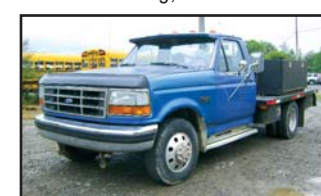
93 Ford F350XL

1991 CHEVROLET Model Kodiak Utility Truck , powered by Cat 3116 diesel engine and Allison automatic transmission, equipped with double cab, air conditioning, and 11R22.5 tires. In good condition with good tires.