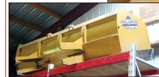
Avalanche 10' Snow Pusher

BLIZZARD 8'6" Hydraulic Angle Snow Plow , equipped with power hitch, mounting bracket, controls, and lights. In good condition • AIRFLO 10' Stainless Steel Salt Spreader , powered by Briggs & Stratton Intek 9HP gas engine. In good condition • FISHER Tailgate Salt Spreader . In good condition • AVALANCHE 10' Bucket Mount Snow Pusher . In very good condition • PRO-TECH 8' Snow Pusher , s/n 8665. In good condition.