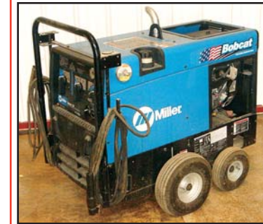
07 Miller Bobcat 225