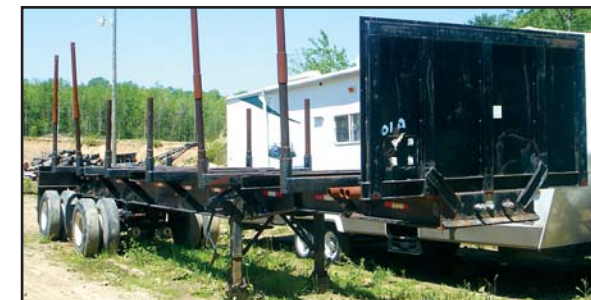
Felburn 40' Log Trailer

FELBURN 40' Spread Axle Log Trailer , equipped with 9' axle spread and 11R22.5 tires. In fair condition with good tires. 2003 PACE Model SL818TA2, 8'x18' Tandem Axle Cargo Trailer , equipped with 7,000# GVWR, fold-up rear door, side door, and 205/75R15 tires. In good condition with good tires. 8'x28' Tandem Axle Office/Storage Trailer , equipped with roll-up rear door, man door, and 7x14.5 tires. In fair to good condition with good tires. ANDERSON Single Axle Utility Trailer , equipped with 6'3"x12" wood deck, 24" metal sides, 50" ramp gate, and 78x15 tires. In good condition with good tires. 8'-11' Extendable Pipe Wagon , equipped with 3'8" uprights and 9.50x15 tires. In fair to good condition with fair to good tires.