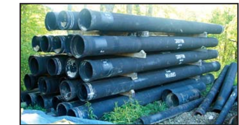
Ductile Iron Pipe

(29) 18' Sections of GRIFFIN NSF-61, 12" Ductile Iron Pipe • Precast Inlets & Collars • (1 Pallet) LAFARGE Type I Motors • (1 Pallet) Construction Grout • Small Quantity Plastic & Corrugated Plastic Pipe • Landscape Fabric • Metal Pipe Bands • (10 Pallets) Landscape & Retaining Blocks • Small Quantity of Pallet Racking • Small Quantity of Scrap Steel • Small Quantity of Copper Tubing • Small Quantity of Pipe Couplings & Fittings • (4) Water Keys • Miscellaneous