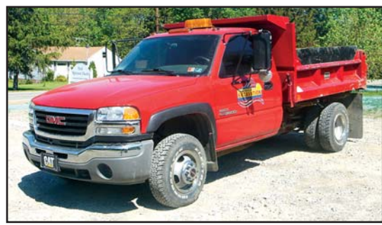
06 GMC 3500 4x4

2006 INTERNATIONAL Model Paystar 5900i Eagle Tri-Axle Dump Truck , powered by Cat C-15, 475HP diesel engine and Eaton Fuller 18 speed transmission, equipped with J&J 18' aluminum dump body with chute and electric tarp, 46,000# rears, 20,000# front axle, 20,000# airlift 3rd axle, Hendrickson air ride suspension, tow package with air, 3-position engine brake, aluminum wheels, air conditioning, cruise control, heated mirrors, power windows, locks and mirrors, and 385/65R22.5 front, 11R24.5 rear and 315/80R22.5 airlift axle tires. In very good condition with poor front and good rear and airlift axle tires. (71,171 Miles) (Purchased New-Balances of Cat Engine Basic Warranty Until 3/30/09 and Extended Warranty Until 3/30/12)