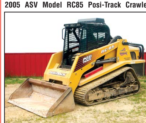
05 ASV RC85

2005 ASV Model RC85 Posi-Track Crawler Skid Steer Loader , s/n RSF00781, powered by Perkins diesel engine and hydrostatic transmission, equipped with 72" loader bucket with bolt-on cutting edge, dual hi-flow hydraulic outlets, electric outlet, enclosed ROPS cab, air conditioning, light package, and 7'3"x18" rubber crawlers. In very good condition with very good undercarriage. (977 Hours) (Purchased New-Balance of Extended Power Train Warranty Through 6/28/09)