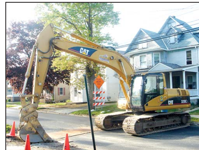
'06 Cat 320CL

2006 CATERPILLAR Model 320CL Hydraulic Excavator , s/n PAB05487, powered by Cat 3066 diesel engine and hydraulic drive, equipped with 9'6" dipper stick, Cat hydraulic quick coupler, 24" digging bucket with side cutters, hydraulic plumbing, air conditioning, light package, factory stereo, 14'7" crawlers, and 32" TBG pads. In very good condition with very good undercarriage. (01,484 Hours) (Purchased New-Balance of Transferable Extended Power Train Warranty Through 2/15/09)