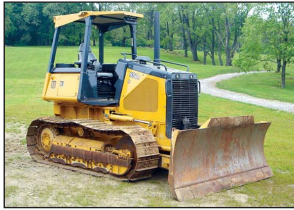
06 John Deere 650J LT

2006 JOHN DEERE Model 650J LT Crawler Tractor , s/n 123258, powered by John Deere Powertech diesel engine and push button powershift transmission, equipped with 6-way straight blade, differential steering, tow pin, ROPS canopy, light package, and 19.5" SBG pads. In excellent condition with very good undercarriage. (744 Hours) (Purchased New-Balance of Extended Power Train and Hydraulics Warranty Through 4/17/10)