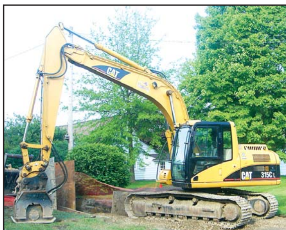
'05 Cat 315CL

ATTACHMENTS: CAT CVP110, 29"x44" Hydraulic Plate Compactor • ESCO 48" Digging Bucket with side cutters (Komatsu PC138) • ESCO 48" Clean-Up Bucket (Komatsu PC138) • CAT 48" Digging Bucket with side cutters (Cat 320) • CAT 36" Digging Bucket with side cutters (Cat 320/318) • CAT 36" Digging Bucket with side cutters (Cat 320/318) • CAT 48" Digging Bucket with side cutters (Cat 315) • CAT 60" Clean-Up Bucket with perforated sides (Cat 315)