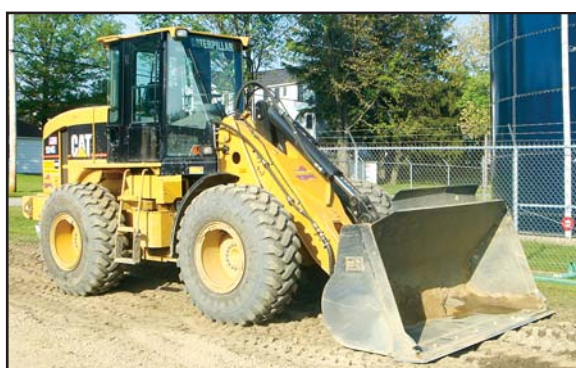
'06 Cat 924G

2006 CATERPILLAR Model 924G Rubber Tired Loader , s/n CAT0924GPDDA03277, powered by cat 3056E diesel engine and powershift transmission, equipped with general purpose 2.8 cubic yard loader bucket with bolt-on cutting edge, hydraulic quick coupler, auxiliary hydraulics, enclosed ROPS cab, air conditioning, light package, and 20.5R25 tires. In excellent condition with very good tires. (704 Hours) (Purchased New-Balance of Transferable Extended Power Train Warranty Through 2/25/10)