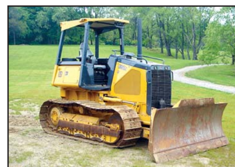
'06 JOHN DEERE 650J LT

PRE-SORTED FIRST CLASS MAIL US POSTAGE PAID HAVERTOWN, PA PERMIT #45