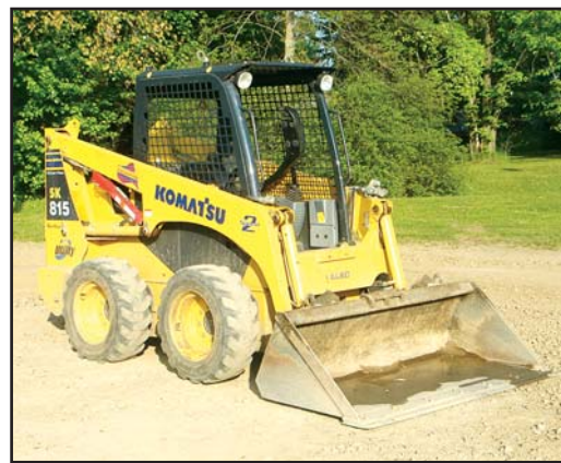
07 Komatsu SK815-5N

2007 KOMATSU Model SK815-5N Skid Steer Loader , s/n A30137, powered by Komatsu/Yanmar diesel engine and 2 speed hydrostatic transmission, equipped with 68" loader bucket with bolt-on cutting edge, dual high flow hydraulic outlets, electric outlets, light package, and 10x16.5 tires. In good condition with fair tires.