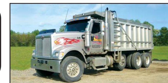
'06 INT'L 5900i EAGLE

1440 COWPATH RD. • HATFIELD, PA 19440 215/361-9099 • Fax: 215/361-9212