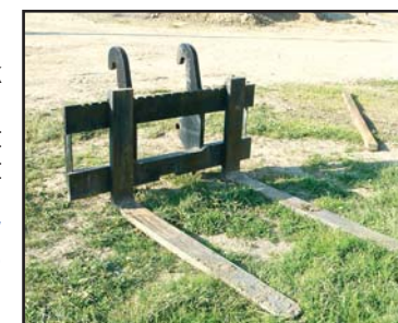
60" Fork Attachment

60" Fork Attachment. In good condition. (Cat 924G)