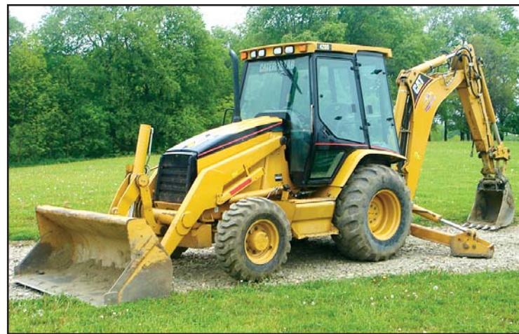
04 Cat 420D, 4x4 Extend-A-Hoe

2004 CATERPILLAR Model 420D, 4x4 Tractor Loader Extend-A-Hoe , s/n FDP21330, powered by Cat 3054 diesel engine and shuttle transmission, equipped with Cat general purpose loader bucket with bolt-on cutting edge, 24" digging bucket, Cat rear manual quick coupler, hydraulic plumbing, enclosed ROPS cab, air conditioning, light package, and 12.5/8-18 front and 19.5Lx24 rear tires. In very good condition with good rear and good and very good front tires. (1,700 Hours) (Purchased New)