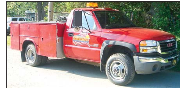
06 GMC 3500 4x4

2006 GMC Model 3500, 4x4 Utility Truck , powered by Duramax diesel engine and automatic transmission, equipped with 9' open utility body, dual fuel tanks, dual rear wheels, 105 gallon fuel tank with electric pump, air conditioning, and 215/85R16 tires. In good condition with good to very good tires. (32,091 Miles) (Purchased New-Balance of 3 Year/36,000 Mile Basic Warranty)