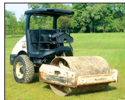
04 IR SD-70DTF

2004 INGERSOLL-RAND Model SD-70DTF Vibratory Compactor , s/n 176885, powered by Cummins B4.5-99C diesel engine and hydrostatic transmission, equipped with 66" smooth drum, drum cleaner, drum drive, ROPS canopy, and 14.9x24 tires. In good condition with good tires. (01,335 Hours)