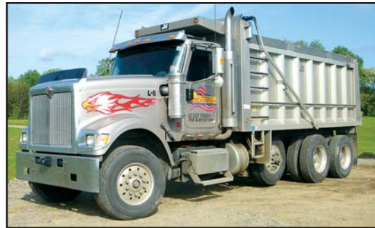
06 Int'l 5900i Eagle

2006 INTERNATIONAL Model Paystar 5900i Eagle Tri-Axle Dump Truck , powered by Cat C-15, 475HP diesel engine and Eaton Fuller 18 speed transmission, equipped with J&J 18' aluminum dump body with chute and electric tarp, 46,000# rears, 20,000# front axle, 20,000# airlift 3rd axle, Hendrickson air ride suspension, tow package with air, 3-position engine brake, aluminum wheels, air conditioning, cruise control, heated mirrors, power windows, locks and mirrors, and 385/65R22.5 front, 11R24.5 rear and 315/80R22.5 airlift axle tires. In very good condition with poor front and good rear and airlift axle tires. (71,171 Miles) (Purchased New-Balances of Cat Engine Basic Warranty Until 3/30/09 and Extended Warranty Until 3/30/12)