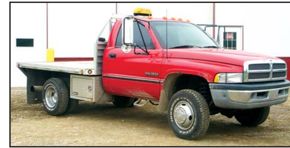
94 Dodge 3500 4x4

2006 GMC Model 3500, 4x4 Utility Truck , powered by Duramax diesel engine and automatic transmission, equipped with 9' open utility body, dual fuel tanks, dual rear wheels, 105 gallon fuel tank with electric pump, air conditioning, and 215/85R16 tires. In good condition with good to very good tires. (32,091 Miles) (Purchased New-Balance of 3 Year/36,000 Mile Basic Warranty)