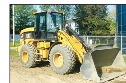
'06 CAT 924G