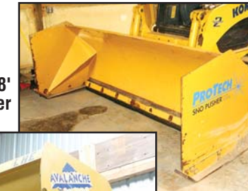
Pro-Tech 8' Snow Pusher