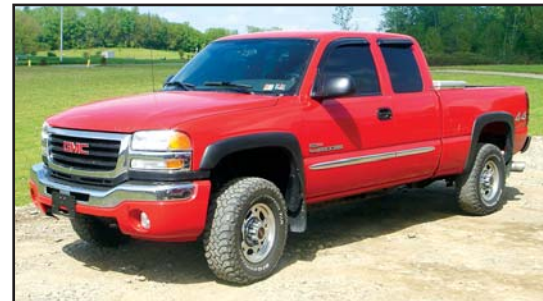
05 GMC 2500HD 4x4

2005 GMC Model 2500HD SLE, 4x4 Quad Cab Pickup Truck , powered by Duramax 6.6L Turbo diesel engine and automatic transmission, equipped with 7' bed, spray-on bed liner, cross toolbox, aluminum wheels, air conditioning, cruise control, power windows, locks and mirrors, and 265/75R16 tires. In good condition with fair to good tires. (111,005 Miles) (Purchased New) • Pickup Truck Fuel Tank with electric pump. In good condition.