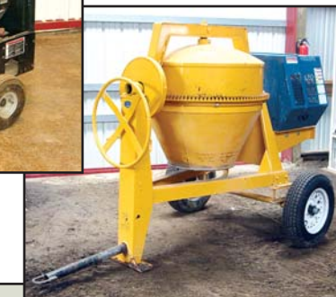
Stone 95CM Cement Mixer