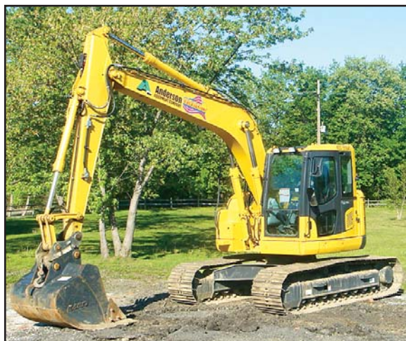
'07 Komatsu PC138USLC-8

2006 CATERPILLAR Model 320CL Hydraulic Excavator , s/n PAB05487, powered by Cat 3066 diesel engine and hydraulic drive, equipped with 9'6" dipper stick, Cat hydraulic quick coupler, 24" digging bucket with side cutters, hydraulic plumbing, air conditioning, light package, factory stereo, 14'7" crawlers, and 32" TBG pads. In very good condition with very good undercarriage. (01,484 Hours) (Purchased New-Balance of Transferable Extended Power Train Warranty Through 2/15/09)