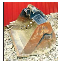
(1) of (4) Backhoe Buckets