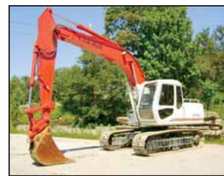
'98 Link-Belt 2700 Quantum