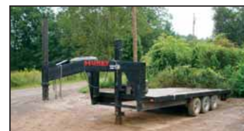
'90 Hurst Tilt Deck Gooseneck

2008 WITZCO Challenger RG35, 35 Ton Tandem Axle Lowboy Trailer , ground bearing detachable gooseneck, gas pony motor, 22'6"x8'6" load deck, 9' open deck over wheels, outriggers, and chain dogs. In good to very good condition with good tires. 1992 R/S 38' Spread Axle Aluminum Dump Trailer , 10'3" spread axle, 2-way air controlled tailgate with chute, plastic bed liner, steel full frame, Hendrickson air ride suspension, aluminum Budd wheels, and 285/75R24.5 tires. In good condition with good tires. 1990 HURST Tri-Axle Hydraulic Tilt Deck Gooseneck Trailer , self contained hydraulic bed hoist, 12,000# electric winch, 20'x8' load deck with 5' hide-away ramps, electric brakes, 18,000# GVWR, 4,000# empty weight, and 8x14.5 tires. In good condition with good tires. 1977 GENERAL 25 Ton Gooseneck Trailer , 22'x8' load deck, 3' beavertail, ramps, and air brakes.