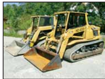
ASV 4520 and 4810

2000 BOBCAT 864 Crawler Skid Steer Loader , s/n 518912514, diesel and hydrostatic trans, 72" loader bucket, hydraulic and electric outlets, light package, and 72"x18" rubber crawlers. In good condition with good undercarriage.