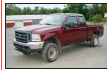
'04 Ford F-250XL 4x4

2000 FORD F-350XL Super Duty Utility Truck , Powerstroke 7.3 liter V-8 diesel and 5 speed trans, Stahl 9' open utility body, dual rear wheels, tow package with electric, ac, AM/FM stereo, and LT225/75R16 tires. In good condition with good tires. 2004 FORD F-250XL, 4x4 Super Duty Quad Cab Pickup Truck , Triton 5.4 liter V-8 gas and auto trans, 6.5' bed with 105 gallon step fuel tank with 12 volt pump, cross tool box, tow package with electric, ac, AM/FM CD, and LT265/75R16 tires. In good condition with good tires. 1995 CHEVROLET 20 Cargo Van , 4.3 liter V-6 gas and auto trans, Masterack tool bins and shelves, material roof rack, AM/FM stereo, and 225/75R15 tires. In good condition with good tires.