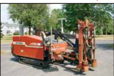
'04 Ditch Witch JT1720