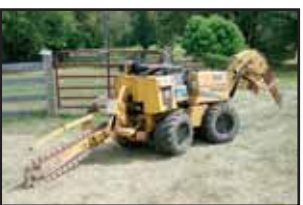
'06 Vermeer LM42