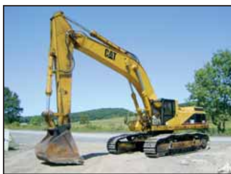
'98 Cat 375L

1998 CATERPILLAR 375L Hydraulic Excavator , s/n 1JM00416, Cat 3406B diesel and hydraulic drive, 15'6" dipper stick, 60" digging bucket, hydraulic counterweight removal device, operators cab with ac, 20'10" crawlers, and 35.5" DBG pads. In good condition with good undercarriage. (New Swing Motor Installed 8/08)