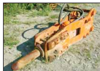
'97 Kent KHB30G