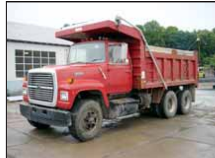
'90 Ford L8000