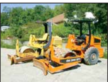
Rammax RW3000 and S35K

1987 INGERSOLL RAND DA-50 Tandem Vibratory Roller , s/n 6298S, Detroit diesel and hydrostatic trans, 75" smooth drums, dual drum drive, water system, swing controls, and ROPS canopy. In fair to good condition. 1991 RAMMAX RW3000 SPT Vibratory Padfoot Compactor , s/n 69180, Kubota diesel and hydrostatic trans, 48" padfoot drum, drum drive, 55" 4-way blade, and ROPS canopy. In good condition with good tires. 1999 RAMMAX S35K2B Vibratory Compactor , s/n 527977, diesel and hydrostatic trans, 35-1/2" smooth drum, drum drive, 43" backfill blade, ROPS canopy, and 7.50x16 tires. In good condition with good tires.