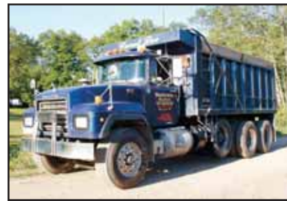
'00 Mack RD688S