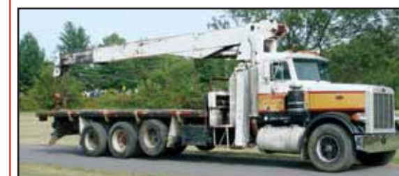
'88 Pete w/ Pitman 18 Ton

1988 PETERBILT 357 Tri-Axle Boom Truck , Cat 3406B, 425HP diesel and Fuller Roadranger 8LL, 10 speed trans, Pitman HL-18T-85, 18 ton 58' 3-stage hydraulic boom with weighted hook, (4) hydraulic outriggers and dual operator stations, 46,000# rears, 20,000# front axle, 20,000# lift axle, 25' flatbed with ratchet tie-down straps, airlift 3rd axle, double framed, 2-stage Jake brake, tow package with electric, aluminum Budd wheels, and 11R24.5 tires. In fair to good condition with fair to good tires.