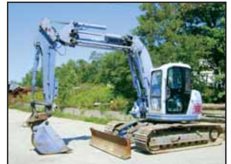
'97 Komatsu PC-128UU

1993 CASE 9040 Hydraulic Excavator , s/n DAC0400078, Case diesel and hydraulic drive, 10' dipper stick with hydraulic beyond, 30" digging bucket with side cutters, light package, 32" TBG pads, and 15'6" crawlers. In good condition with good undercarriage.