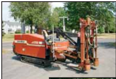
'04 Ditch Witch JT1720