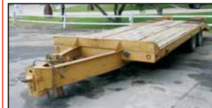
'93 Eager Beaver 20 Ton

1993 EAGER BEAVER 20 Ton Tandem Axle Tag-A-Long Trailer , 19'x8'6" deck, 5' beavertail, ramps, tie downs, air brakes, and 215/75R17.5 tires. In good condition with good tires. 2005 BELMONT Tandem Axle Tag-A-Long Trailer , 20'x7'2", 5' spring loaded ramps, electric brakes, 7,000# GVWR, and ST205/75R15 tires. In good condition with good tires. 2004 BELSHE Tandem Axle Tag-A-Long Trailer , 8' x 19' load deck with 6' beavertail and 5' ramps, wooden deck, Bulldog 10,000# landing gear, electric brakes, dual wheels, and LT235/85R16 tires. In good condition with good tires.