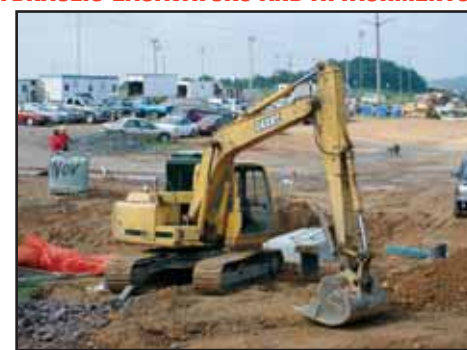
'00 JD 120

1998 LINK-BELT 2700 Quantum Hydraulic Excavator , s/n E5180128, Isuzu diesel and hydraulic drive, 10' dipper stick with hydraulic beyond, 24" digging bucket, Hendrix hydraulic quick coupler, light package, 24" TBG pads, and 12'10" crawlers. In good condition with fair undercarriage.