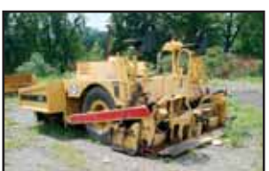
'90 Blaw-Knox PF150