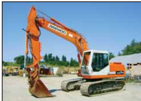
'98 Daewoo SL70-3

1997 JOHN DEERE 892ELC Hydraulic Excavator , s/n FF892EX012294, John Deere diesel and hydraulic drive, 13' dipper stick, light package, 15'11" crawlers, and 32" TBG pads. In fair to good condition with fair to good undercarriage. (Zero Hours On Rebuilt Swivel Pumps and Boom Cylinders)