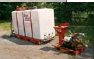
Ditch Witch Mud System