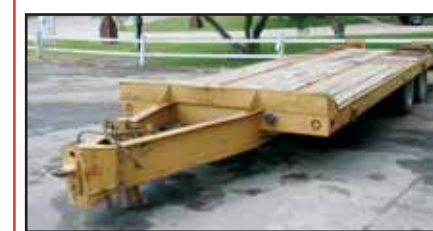
'93 Eager Beaver 20 Ton

1993 EAGER BEAVER 20 Ton Tandem Axle Tag-A-Long Trailer , 19'x8'6" deck, 5' beavertail, ramps, tie downs, air brakes, and 215/75R17.5 tires. In good condition with good tires.