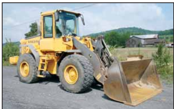
'04 Volvo L70E

2004 VOLVO L70E Rubber Tired Loader , s/n L70EV60462, Volvo diesel and powershift trans, general purpose loader bucket with bolt-on cutting edge, hydraulic quick coupler, front auxiliary hydraulics, EROPS with heat and ac, light package, and 20.5R25 tires. In good condition with fair to good tires. 48" Fork Attachment (Fits L70E)