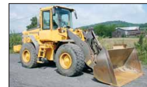
'04 VOLVO L70E