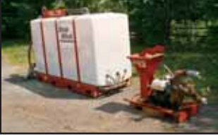
Ditch Witch Mud System