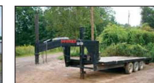
'90 Hurst Tilt Deck Gooseneck

2008 WITZCO Challenger RG35, 35 Ton Tandem Axle Lowboy Trailer , ground bearing detachable gooseneck, gas pony motor, 22'6"x8'6" load deck, 9' open deck over wheels, outriggers, and chain dogs. In good to very good condition with good tires.