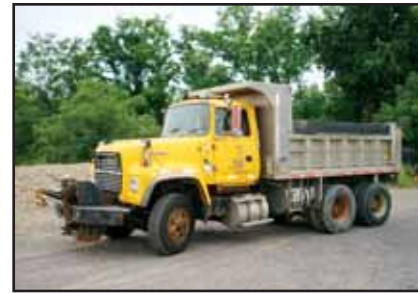
'93 Ford L9000

2000 MACK RD688S Tri-Axle Dump Truck , Mack E7-427, 427HP diesel and Fuller 8LL, 10 speed trans, J&S 17'6" heated steel dump body with bed vibrator, air gate and power tarp, 46,000# rears, 20,000# front and lift axles, 2-stage brake, tow package with air, front aluminum Budd wheels, camelback suspension, ac, heated mirrors, 385/65R22.5 front and 11R24.5 rear tires. In good condition with very good tires. (New Turbo; New Front and Lift Tires; New Clutch 7/07-Approx. 15,000 Miles)