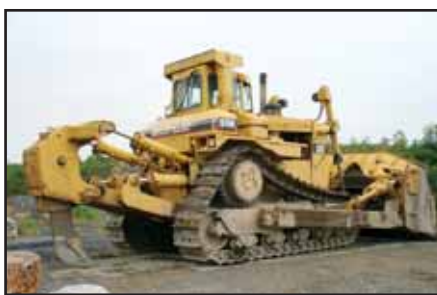
'89 Cat D10N with Ripper