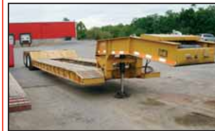
'08 Witzco Challenger 35 Ton