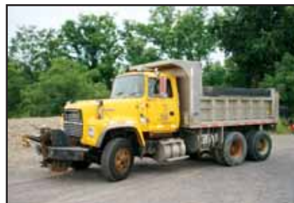
'93 Ford L9000

J&J 17'6" Aluminum Dump Body , s/n TA12015, 4'6" sides, cab protector, air tailgate, and tarp frame. In fair to good condition. (Floor Fair)