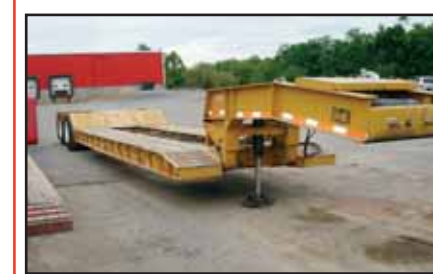
'08 Witzco Challenger 35 Ton