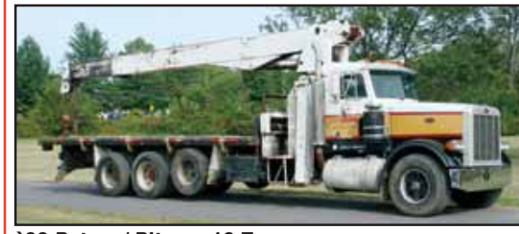
'88 Pete w/ Pitman 18 Ton

1988 PETERBILT 357 Tri-Axle Boom Truck , Cat 3406B, 425HP diesel and Fuller Roadranger 8LL, 10 speed trans, Pitman HL-18T-85, 18 ton 58' 3-stage hydraulic boom with weighted hook, (4) hydraulic outriggers and dual operator stations, 46,000# rears, 20,000# front axle, 20,000# lift axle, 25' flatbed with ratchet tie-down straps, airlift 3rd axle, double framed, 2-stage Jake brake, tow package with electric, aluminum Budd wheels, and 11R24.5 tires. In fair to good condition with fair to good tires.