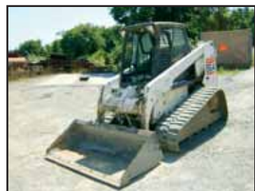
'00 Cat 864