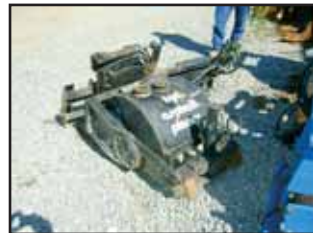
Gehl 18" Mill

2005 BOBCAT Brush Cat 60, 60" Hydraulic Brush Cutter Attachment , s/n 467201148. In good condition. GEHL 18" Hydraulic Asphalt Milling Attachment , s/n Unknown, hydraulic angle and hydraulic raise and lower. In good condition. (Fits Skid Steer)