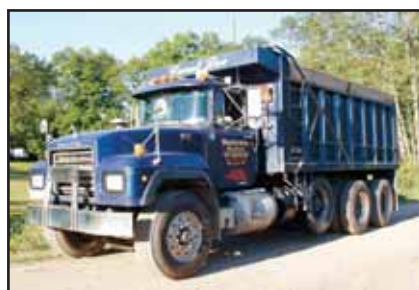
'00 Mack RD688S

2000 MACK RD688S Tri-Axle Dump Truck , Mack E7-427, 427HP diesel and Fuller 8LL, 10 speed trans, J&S 17'6" heated steel dump body with bed vibrator, air gate and power tarp, 46,000# rears, 20,000# front and lift axles, 2-stage brake, tow package with air, front aluminum Budd wheels, camelback suspension, ac, heated mirrors, 385/65R22.5 front and 11R24.5 rear tires. In good condition with very good tires. (New Turbo; New Front and Lift Tires; New Clutch 7/07-Approx. 15,000 Miles)