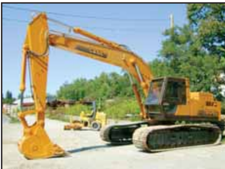
'93 Case 9040