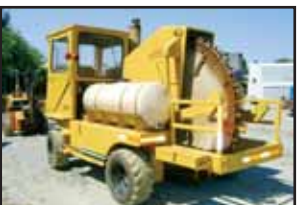
'90 Vermeer CC135

2004 DITCH WITCH JT1720 Hydraulic Directional Drill , s/n 2Y0510, John Deere 82HP diesel, Jet Trac Mach 7 locating system with D.W. 750 subsite electronic display, ESID strike alert, 10' magazine rack with auto change-out, auto hydraulic stake downs, umbilical remote for travel, 17,000# thrust/pull back, 1,900 ft lbs torque, 2004 Ditch Witch FM13 Mud Pump, s/n 2Y0496, Honda 13HP gas, MP 31714 Flomax 15, 13" pump, 1,000 gallon skid mounted poly tank with roll-jet mixing. In good condition with good undercarriage. (No Drill Steel)