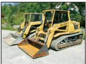
ASV 4520 and 4810

2000 BOBCAT 864 Crawler Skid Steer Loader , s/n 518912514, diesel and hydrostatic trans, 72" loader bucket, hydraulic and electric outlets, light package, and 72"x18" rubber crawlers. In good condition with good undercarriage.