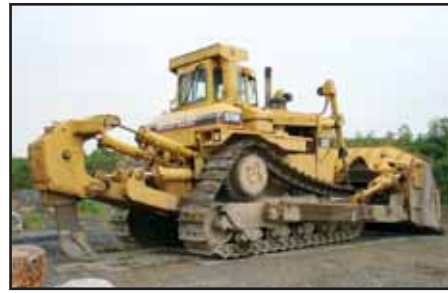
'89 Cat D10N with Ripper