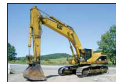
'98 CAT 375L

1440 COWPATH RD. • HATFIELD, PA 19440 215/361-9099 • Fax: 215/361-9212