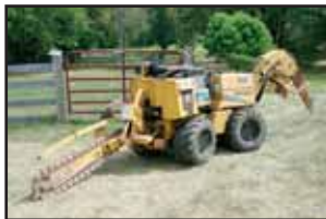
'06 Vermeer LM42