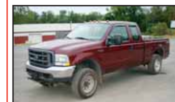
'04 Ford F-250XL 4x4

2000 FORD F-350XL Super Duty Utility Truck , Powerstroke 7.3 liter V-8 diesel and 5 speed trans, Stahl 9' open utility body, dual rear wheels, tow package with electric, ac, AM/FM stereo, and LT225/75R16 tires. In good condition with good tires.