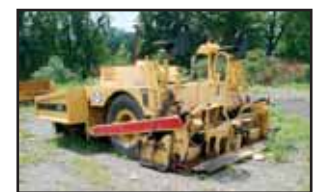
'90 Blaw-Knox PF150