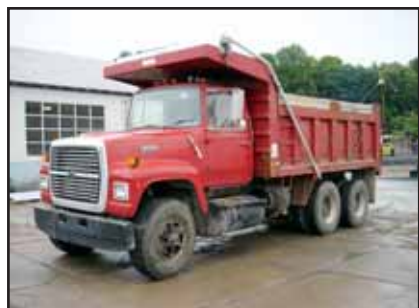
'90 Ford L8000

2000 MACK RD688S Tri-Axle Dump Truck , Mack E7-427, 427HP diesel and Fuller 8LL, 10 speed trans, J&S 17'6" heated steel dump body with bed vibrator, air gate and power tarp, 46,000# rears, 20,000# front and lift axles, 2-stage brake, tow package with air, front aluminum Budd wheels, camelback suspension, ac, heated mirrors, 385/65R22.5 front and 11R24.5 rear tires. In good condition with very good tires. (New Turbo; New Front and Lift Tires; New Clutch 7/07-Approx. 15,000 Miles)