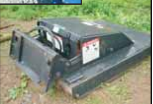
'05 Bobcat 60" Brush Cutter