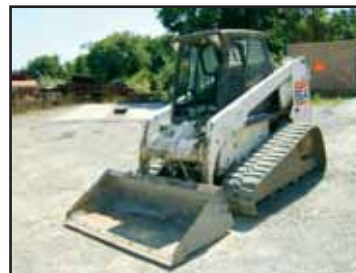
'00 Cat 864