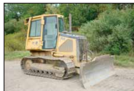
'04 JD 650H

1989 CATERPILLAR D10N Crawler Tractor , s/n 2YD00960, Cat 3412 diesel and powershift trans, 17'2" U-blade with tilt, Cat 4-barrel single shank ripper, s/n 1XH00467, ROPS over enclosed cab with ac, light package, and 30" SBG pads. In good condition with good undercarriage. D10N Track Group (Trek) , complete with 28" SBG pads, approximately 30-40% wear. In good condition. 2004 JOHN DEERE 650H Crawler Tractor , s/n T0650HX907533, John Deere diesel and powershift trans, 120" 6-way hydraulic straight blade, (wide blade) EROPS with ac, and 18" SBG pads. In good condition with good undercarriage.