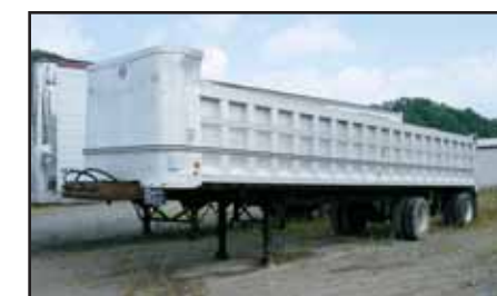
'92 Aluminum Spread Axle Dump