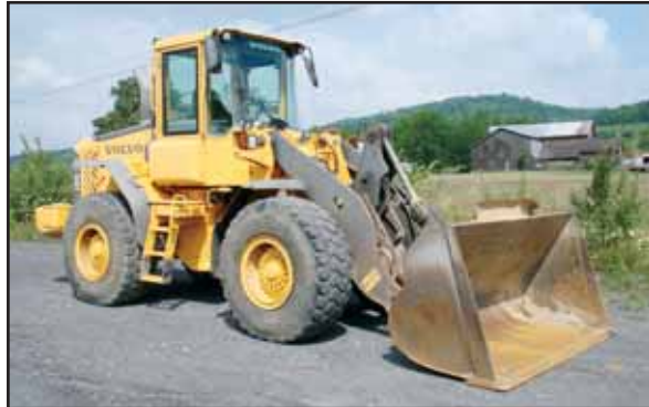
'04 Volvo L70E

2004 VOLVO L70E Rubber Tired Loader , s/n L70EV60462, Volvo diesel and powershift trans, general purpose loader bucket with bolt-on cutting edge, hydraulic quick coupler, front auxiliary hydraulics, EROPS with heat and ac, light package, and 20.5R25 tires. In good condition with fair to good tires. 48" Fork Attachment (Fits L70E)