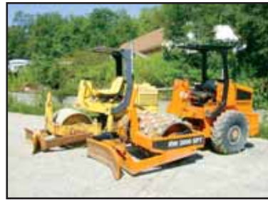
Rammax RW3000 and S35K

1987 INGERSOLL RAND DA-50 Tandem Vibratory Roller , s/n 6298S, Detroit diesel and hydrostatic trans, 75" smooth drums, dual drum drive, water system, swing controls, and ROPS canopy. In fair to good condition. 1991 RAMMAX RW3000 SPT Vibratory Padfoot Compactor , s/n 69180, Kubota diesel and hydrostatic trans, 48" padfoot drum, drum drive, 55" 4-way blade, and ROPS canopy. In good condition with good tires. 1999 RAMMAX S35K2B Vibratory Compactor , s/n 527977, diesel and hydrostatic trans, 35-1/2" smooth drum, drum drive, 43" backfill blade, ROPS canopy, and 7.50x16 tires. In good condition with good tires.