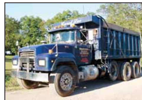
'00 MACK RD688S

PRE-SORTED FIRST CLASS MAIL US POSTAGE PAID HAVERTOWN, PA PERMIT #45