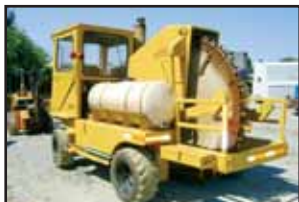
'90 Vermeer CC135

2004 DITCH WITCH JT1720 Hydraulic Directional Drill , s/n 2Y0510, John Deere 82HP diesel, Jet Trac Mach 7 locating system with D.W. 750 subsite electronic display, ESID strike alert, 10' magazine rack with auto change-out, auto hydraulic stake downs, umbilical remote for travel, 17,000# thrust/pull back, 1,900 ft lbs torque, 2004 Ditch Witch FM13 Mud Pump, s/n 2Y0496, Honda 13HP gas, MP 31714 Flomax 15, 13" pump, 1,000 gallon skid mounted poly tank with roll-jet mixing. In good condition with good undercarriage. (No Drill Steel)