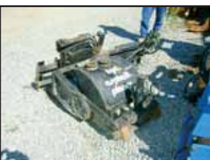
Gehl 18" Mill

2005 BOBCAT Brush Cat 60, 60" Hydraulic Brush Cutter Attachment , s/n 467201148. In good condition. GEHL 18" Hydraulic Asphalt Milling Attachment , s/n Unknown, hydraulic angle and hydraulic raise and lower. In good condition. (Fits Skid Steer)