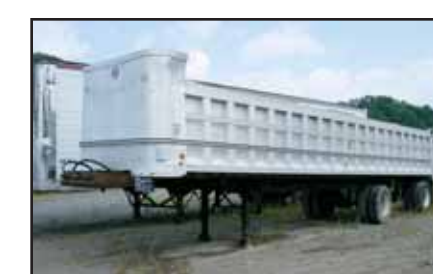
'92 Aluminum Spread Axle Dump