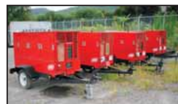
(4) '90 IR 100CFM

BARNES NS200CCD, 10" Skid Mounted Centrifugal Pump , s/n 27977-187, Detroit diesel, rated at 3000GPM @ 30TH. In good condition.