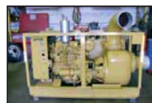
Barnes 10" Diesel