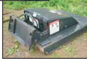
'05 Bobcat 60" Brush Cutter