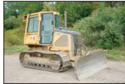
'04 JD 650H

1989 CATERPILLAR D10N Crawler Tractor , s/n 2YD00960, Cat 3412 diesel and powershift trans, 17'2" U-blade with tilt, Cat 4-barrel single shank ripper, s/n 1XH00467, ROPS over enclosed cab with ac, light package, and 30" SBG pads. In good condition with good undercarriage. D10N Track Group (Trek) , complete with 28" SBG pads, approximately 30-40% wear. In good condition. 2004 JOHN DEERE 650H Crawler Tractor , s/n T0650HX907533, John Deere diesel and powershift trans, 120" 6-way hydraulic straight blade, (wide blade) EROPS with ac, and 18" SBG pads. In good condition with good undercarriage.