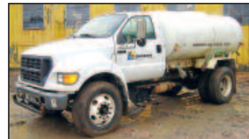
'00 FORD F-750X