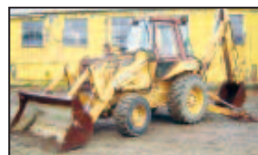
'88 Case 780D 4x4