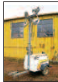
Allmand NiteLite Pro