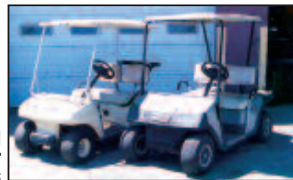
EZ Go and Club Car Golf Carts

EZ-GO Model 43 Golf Cart , s/n 586828, powered by Perkins 1 cylinder gas engine, equipped with 18x5.5 tires. In good condition with good tires.