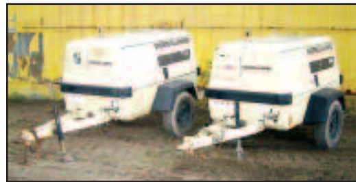
(2) Ingersoll Rand P185WJD