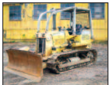
'94 Komatsu D37E

1994 KOMATSU Model D37-E Crawler Tractor , s/n 3276, powered by Komatsu diesel engine and powershift transmission, equipped with 6-way blade, Carco 30B winch, forest package, and 16" SBG pads. In fair to good condition with fair to poor undercarriage.