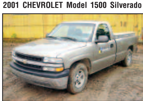
'01 Chevy 1500 Silverado

2000 GMC Model 1500 Sierra SL Pickup Truck , powered by V-6 gas engine and automatic transmission, equipped with 8' bed, cross toolbox, air conditioning, and AM/FM stereo. In fair to good condition with fair to good tires.