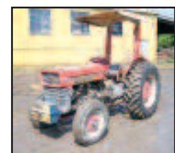
Massey Ferguson 135