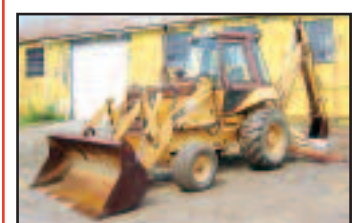
'86 Case 780C