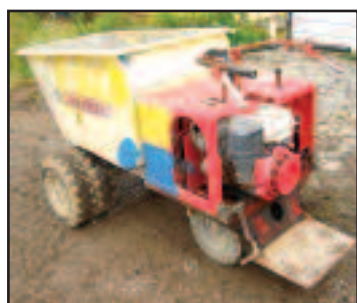
Whiteman Power Buggy