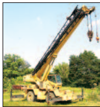
'90 GROVE RT630B

PRE-SORTED FIRST CLASS MAIL US POSTAGE PAID HAVERTOWN, PA PERMIT #45