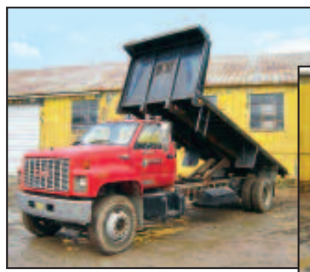
'91 GMC Topkick