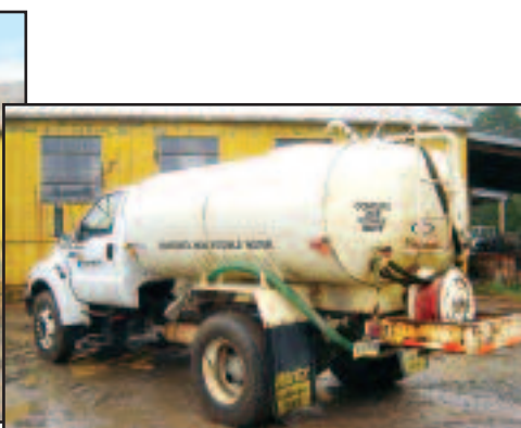
'00 Ford F-750X

2000 FORD Model F-750X Super Duty Water Truck , powered by International 210M diesel engine and 6 speed transmission, equipped with 2,000 gallon water tank, PTO driven pump, front, rear, and side spray bars, rear hose reel, Chelsea PTO, air conditioning, and 11R22.5 tires. In good condition with good tires.