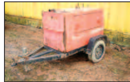
Multiquip 250 Amp

1999 INGERSOLL-RAND Model P185WJD Portable Air Compressor , s/n 300210UDJ221, powered by John Deere diesel engine. In good condition with good tires.