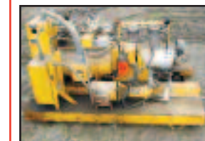
Hydro Blaster 610E