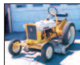
IHC Cub LoBoy

1988 CASE Model 780D, 4x4 Tractor Loader Backhoe , s/n JJG0071566, powered by Case diesel engine and shuttle transmission, equipped with general purpose loader bucket, 30" digging bucket, enclosed ROPS cab with heat and light package, 15x19.5 front and 18.4x28 rear tires. In good condition with fair to good tires. 1986 CASE Model 780C Tractor Loader Backhoe , s/n 9161503, powered by Case diesel engine and shuttle transmission, equipped with general purpose loader bucket, 16" digging bucket, enclosed ROPS cab with heat and light package, 14x17.5 front and 21Lx24 rear tires. In fair to good condition with fair to good tires. CASE 36" Digging Bucket MASSEY FERGUSON Model 135 Utility Tractor , s/n 9A108093, powered by 3 cylinder gas engine and direct drive transmission, equipped with 3-point hitch, PTO, and roll-bar. In good condition with good tires. INTERNATIONAL Model Cub Lo-Boy Utility Tractor , s/n 20664J, powered by 4 cylinder gas engine, equipped with Woods 5' mower deck with hydraulic raise and lower, 4x12 front and 8x3x24 rear turf tires. In good condition with good tires. (Completely Restored) (1 Set) 12" Steel Grouser Pads (Fits Skid Steer)