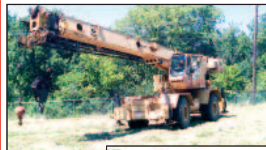
'90 Grove RT630B