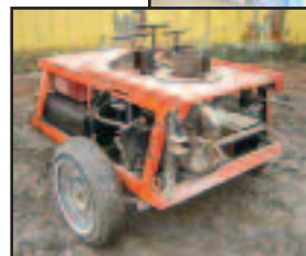
Midland Rebar Bender