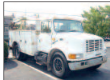
'00 IHC 4700

2000 INTERNATIONAL Model 4700 Single Axle Service Truck , powered by Int'l T44E diesel engine and 5 speed transmission with 2 speed rear, equipped with Stahl 11' open service body, Stahl 3200LR, 32,000# capacity 2-section hydraulic service boom, s/n C-4932020 with wired remote, air conditioning, cruise control, and 10R22.5 tires. In good condition with good to very good tires.