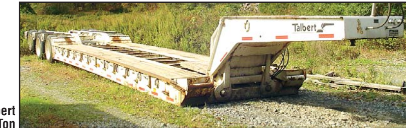
'99 Talbert 51 Ton

(2) 1998 SPECTEC 37' Tri-Axle Steel Dump Trailers . In good condition with good tires. (All Points Capital)