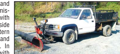
'88 Chevrolet 3500 4x4

1988 CHEVROLET Model 3500, 4x4 Flatbed Truck , powered by V-8 gas engine and automatic transmission, equipped with 8' flatbed with side toolboxes, Western 8'6" snowplow, and 245/75R16 tires. In fair condition with fair tires.