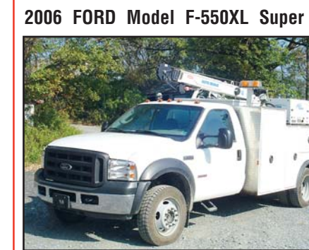
'06 Ford F-550XL 4x4

2006 FORD Model F-550XL Super Duty 4x4 Service Truck , powered by Powerstroke 6.0L, V-8 diesel engine and 6 speed transmission, equipped with J&J 11' open service body with tarp and bows, AutoCrane 6406H, 6,400# 3-section service crane with radio remote, AutoCrane RS60AC hydraulic air compressor, 2006 Miller TrailBlazer 300 amp/10,000 watt welder/generator, powered by Kohler gas engine, (2) hydraulic stabilizers, 110 inverter, dual rear wheels, air conditioning, cruise control, AM/FM CD player, and 225/70R19.5 tires. In very good condition with very good tires. (005,946 Original Miles) (Purchased New)