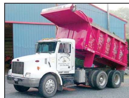
'97 Peterbilt 330

1997 FORD Model LTL9000 Tri-Axle Dump Truck , powered by Cat 3406C, 350HP diesel engine and Eaton Fuller 8LL transmission, equipped with R&S 17' steel dump body with air gate, single chute and manual tarp, 46,000# rears, 18,000# front axle, full locking rears, spring suspension, rear air outlets, and 425/65R22.5 front and 11R22.5 lift and rear tires. In good condition with fair to good tires.