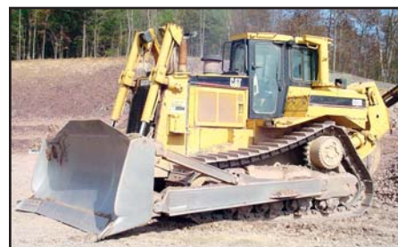
'97 CAT D8R