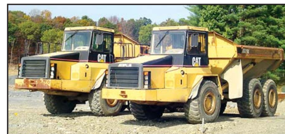
(2) OF (3) CAT D300E