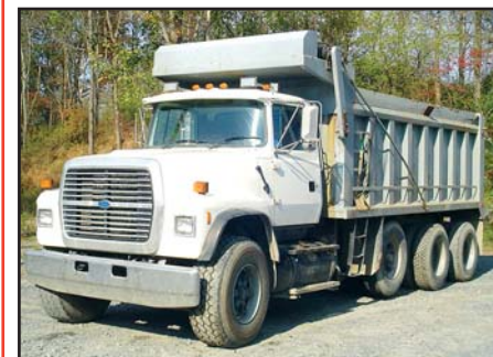
'97 Ford LTL9000

1997 FORD Model LTL9000 Tri-Axle Dump Truck , powered by Cat 3406C, 350HP diesel engine and Eaton Fuller 8LL transmission, equipped with R&S 17' steel dump body with air gate, single chute and manual tarp, 46,000# rears, 18,000# front axle, full locking rears, spring suspension, rear air outlets, and 425/65R22.5 front and 11R22.5 lift and rear tires. In good condition with fair to good tires.