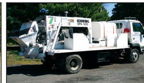
'07 SCHWING BPA500