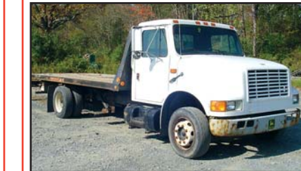
'90 International 4600LP

1990 INTERNATIONAL Model 4600LP Single Axle Rollback Truck , powered by International DT466, 7.3L diesel engine and 5 speed transmission, equipped with Jerr-Dan 20' rollback body with winch, dual rear wheels, and 245/70R19.5 tires. In good condition with good tires.