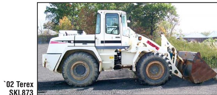
'02 Terex SKL873

2002 TEREX Model SKL873 Rubber Tired Loader , s/n 873S/0175, powered by Perkins 5.9L diesel engine and powershift transmission, equipped with Schaeff 3 cubic yard loader bucket and enclosed ROPS cab. In good condition with good tires. (All Points Capital) HOUGH Model H90-CM Rubber Tired Loader , s/n 27MC-02571, powered by Cummins 6 cylinder diesel engine and powershift transmission, equipped with Drott hydraulic 4-in-1 loader bucket, enclosed ROPS cab, and 16.00x24 tires. In good condition with fair to poor tires. (E.F. Possinger)