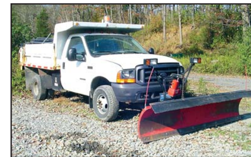
'00 Ford F-350XL 4x4

1984 INTERNATIONAL Model 1654 Single Axle Dump Truck , powered by International 8 cylinder diesel engine and 5 speed transmission, equipped with 9' steel dump body, 9' hydraulic angle snowplow, 8' hydraulic salt spreader, and 9.00R20 tires. In fair to good condition with good tires. (E.R. Linde)