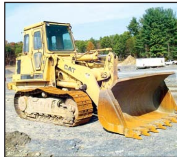
'90 Cat 963LGP

1990 CATERPILLAR Model 963 LGP Crawler Loader , s/n 21Z03234, powered by Cat 3304 diesel engine and hydrostatic transmission, equipped with general purpose bucket with teeth, enclosed ROPS cab with heat, and 21.5" DBG pads. In good condition with fair to poor undercarriage. (Transmission Rebuilt Approx. 500 Hours Ago - Cleveland Bros.) (New Rod & Main Bearings, Turbo Injectors 600 Hours Ago)