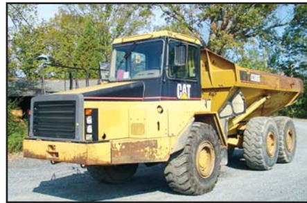
(1) of (3) Cat D300E