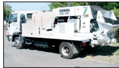
2007 SCHWING BPA500

2007 SCHWING Model BPA500 Concrete Pumper , s/n 171500594, powered by Deutz 72HP diesel engine, equipped with radio and wired remote controls, 200 gallon poly water tank, rated output of: 45 cubic yards per hour; 1100 PSI material pressure, 1,160 ft. horizontal pumping distance; 330 ft. vertical pumping distance, 1" max aggregate size; 11 cubic ft. hopper capacity; rock valve, agitator assembly, 5,200# pump weight, mounted on 1999 UD Model 1800CS Cab Over Single Axle Flatbed Truck, powered by Nissan diesel engine and automatic transmission, equipped with 13' flatbed, dual rear wheels, single frame, 6,830# front axle, 13,000# rear axle, 17,995# GVWR, air conditioning, and 215/75R17.5 tires. Concrete pump in excellent condition, UD carrier in good condition with good tires. (Pumper 008 Original Hours) (Commerce)