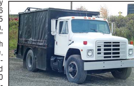
'86 International 1955

1986 INTERNATIONAL Model 1955 Single Axle Lube Truck , powered by International DT466 diesel engine and 5 speed transmission, equipped with 11'6" open lube body with tarp enclosure, Ingersoll-Rand horizontal gas powered air compressor, 600 gallon 4-compartment tank with 12 volt fuel pump and (3) pneumatic pumps, (3) 175 gallon 2-compartment tank with (2) pneumatic pumps, (8) hose reels, air hose reel, waste oil hose reel with pneumatic pump, work lights, and bumper vise, and 11R22.5 tires. In good condition with good tires. (E.R. Linde)