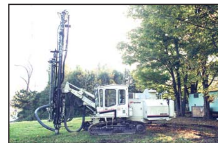
'03 Ingersoll Rand ECM580

2003 INGERSOLL-RAND Model ECM580 Crawler Blasthole Drill , s/n X004108AA, powered by Cummins 5.9L, 127KW diesel engine and hydraulic drive, equipped with Montabert HC80 drifter, telescopic boom, dust collection, anti-jam, reverse percussion, rod changer with (5) T45 drill steel, and enclosed ROPS cab with air conditioning. In good to very good condition. (Purchased New) Spare 14' Drill Leader, Striking Bars, Bits, and Couplers