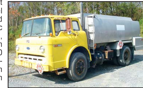
'86 Ford C8000 2,000 Gallon

1986 FORD Model C-8000 Cabover Single Axle Fuel Truck , powered by Cat 3208 diesel engine and Allison automatic transmission, equipped with Tech-Weld 2,000 gallon 2-compartment aluminum fuel body with double bulkhead, (2) pumps and hoses, dual rear wheels, and 10.00R20 tires. In good condition with good tires.