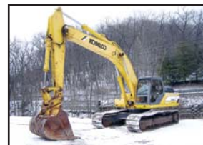
'98 KOBELCO SK300LC IV