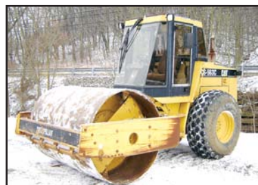
'96 CAT CS563C