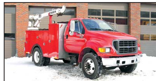
'01 FORD F650XL