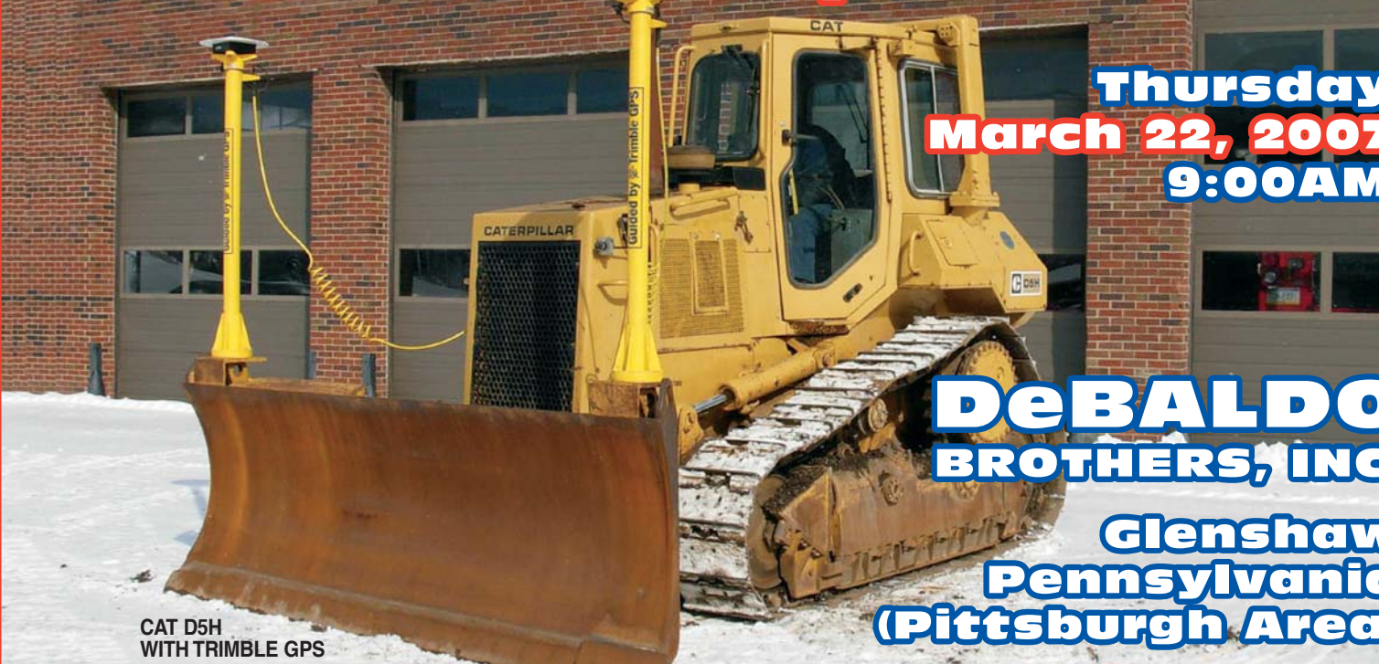
CAT D5H WITH TRIMBLE GPS