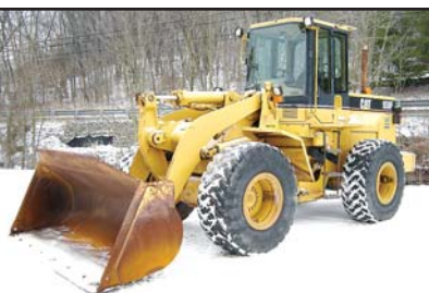
'94 CAT 938F

DeBALDO BROTHERS, INC. Glenshaw Pennsylvania (Pittsburgh Area)