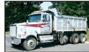
'03 Western Star

2003 WESTERN STAR Model 4984FA Tri-Axle Dump Truck , Cat C-15, 475HP diesel and Eaton Fuller 8LL, Florig 17'6" heated steel dump body with power tarp, air gate, single chute, 46,000# rears, 18,000# front axle, 3-stage brake, air conditioning, cruise control, power windows and mirrors, aluminum front Buds, 315/80R22.5 front and lift axle tires, 11R24.5 rear tires, and 82,000# GVWR. In good condition with good tires.