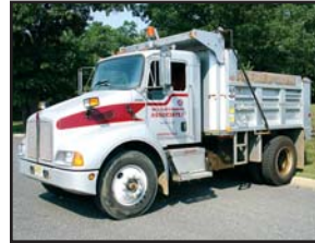
'05 Kenworth T300

2005 KENWORTH Model T300 Single Axle Dump Truck , Cat C-7, 300HP diesel and Eaton Fuller FR011210C, 10 speed trans, Beau-Roc 10' Steel Dump with single chute, air brakes, snowplow package, tow package with air, w/ 10' Blade, hyd tailgate spreader, air conditioning, cruise control, power windows, 11R22.5 tires, and 33,000# GVWR. In good condition with good tires.