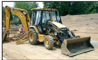
'00 Cat 426C-IT 4x4 Extend-A-Hoe

2000 CATERPILLAR Model 426C-IT, 4x4 Tractor Loader Extend-A-Hoe , s/n 1YR02147, Cat Turbo diesel and shuttle trans, general purpose loader bucket, 24" digging bucket, front quick coupler with 3rd valve, ride control, and enclosed ROPS cab. In good condition with fair to good tires.