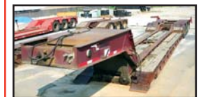
'84 Talbert 60 Ton

1984 TALBERT 60 Ton Tri-Axle Lowboy Trailer , non-ground bearing hydraulic detachable gooseneck, 23'6"x8' drop side load deck, 12' deck over wheels, walking beam suspension, chain dogs, outriggers, and 10,00R15 tires. In good condition with good tires.