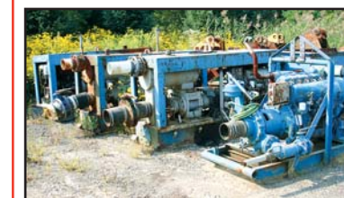
(4) Hydro-Vac 8 and 6 Inch Well Point Pumps

(3) HYDRO-VAC Model HV1500D, 8" Well Point Pumps , s/n's 1007; 1008; 1002, Deutz diesel. In good condition.