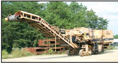
'98 CMI PR-525

1998 CMI Model PR-525 Roto Mill Crawler Milling Machine , s/n 540120, Cat 3408 diesel and hydraulic drive, 72" cutter drum, 36" collecting conveyor, 30"x26' discharge conveyor, (3) 6' crawlers with 14" TBG pads, and water system. In good condition with good undercarriage.