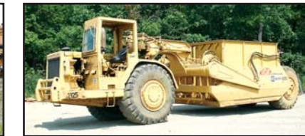
80 Cat 623B 7,000 Gallon

1998 CATERPILLAR Model 613C Series II Elevating Motor Scraper , s/n 8LJ01690, Cat 3116 diesel and powershift trans, supplemental steering, enclosed ROPS cab with air conditioning, and 23.5R25 tires. In good condition with very good front and fair to good rear tires.