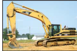
03 Cat 345BL Series II

2005 KOMATSU Model PC400LC-7L Hydraulic Excavator , s/n A86370, Komatsu diesel and hydraulic drive, 11' dipper stick, Esco 42" digging bucket, Galeo package, air conditioning, 17'6" crawlers, and 35.5 TBG pads. In good condition with good undercarriage. (Offered Subject To Creditor's Immediate Confirmation-Please Refer To Bankruptcy Notice On Rear Panel)