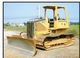
04 John Deere 650H-LGP

2004 JOHN DEERE Model 650H-LGP Crawler Tractor , s/n 939691, John Deere diesel and powershift trans, 6-way straight blade, ROPS canopy, and 27.5" TBG pads. In good condition with good undercarriage. (Offered Subject To Creditor's Immediate Confirmation-Please Refer To Bankruptcy Notice On Rear Panel)