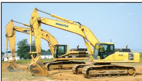
'05 KOMATSU PC400LC-7L AND '03 CAT 345BL SERIES II