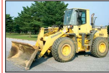
01 Komatsu WA320-3MC

2002 KOMATSU Model WA380-3MC Rubber Tired Loader , s/n A51532, Komatsu/Cummins 8.3 liter diesel and powershift trans, JRB hydraulic quick coupler with 3rd valve, JRB 3.25 cubic yard hydraulic side dump bucket, enclosed ROPS cab with air conditioning, and 23.5R25 tires. In good condition with good tires.