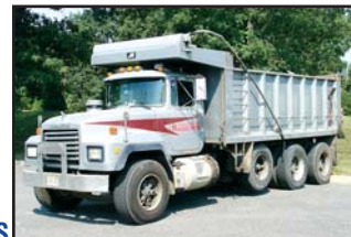
'98 Mack R688S

1998 MACK Model R688S Tri Axle Dump Truck , Mack E7-350 diesel and Eaton Fuller 8LL, J&J 17' heated steel dump body with (2) chutes and power tarp, 18,000# front and 44,000# rear axles, 20,000# lift axle with 385/65R22.5 tires, spring suspension, Jake brake, air conditioning, heated mirrors, and 285/65R22.5 front and 11R24.5 rear tires. In good condition with good tires.