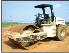
'01 Ingersoll Rand SD-115D

2001 INGERSOLL RAND Model SD-115D ProPac Vibratory Compactor , s/n 165355, Cummins B5.9C, 5.9 liter diesel and hydrostatic trans, 84" smooth drum, drum drive, ROPS canopy, and 23.1x26 tires. In good condition with good tires.