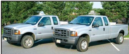
(2) of (3) 05 Ford F-250XL 4x4 Diesels

(3) 2005 FORD Model F-250XLT Super Duty, 4x4 Quad Cab Pickup Trucks , Powerstroke V-8 Turbo diesel and automatic trans, 8' bed, cross toolbox, air conditioning, and 265/70R17 tires. In good condition with good tires.