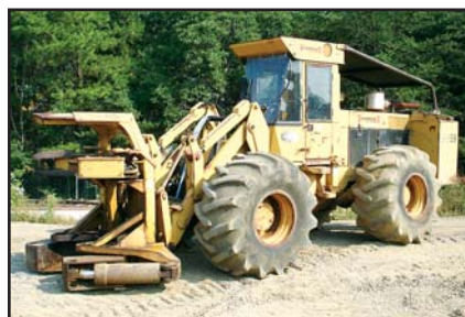
'87 Hydro-Ax 621

1987 HYDRO-AX Model 621 Feller Buncher , s/n 2197, Detroit 4-53 Turbo diesel and hydrostatic trans, hydraulic quick coupler, Feller Buncher axe, enclosed ROPS cab with air conditioning, rear sweeps, and 28Lx26 forestry tires. In good condition with good tires. ATTACHMENTS: 8' rotary axe brush cutter • 12" hydraulic stump grinder.