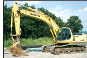
01 Komatsu PC300LC-6LE