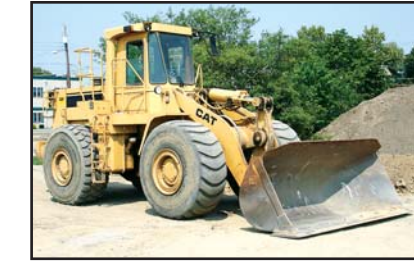
89 Cat 966E