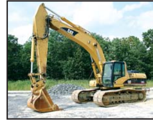
02 Cat 330CL