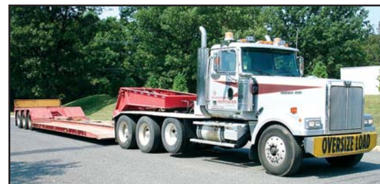
'01 WESTERN STAR AND '97 TALBERT 70 TON