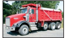
'01 Kenworth T800

2001 KENWORTH Model T800 Tri-Axle Dump Truck , Cat C-15, 475HP diesel and Fuller RTL018918B, 18 speed trans, Bi-Beau 17' steel dump body with air gate, power tarp, single chute, 46,000# rears, 18,740# front axle, 22,500# lift axle, engine brake, walking beam suspension, aluminum Buds, air cab, air seat, air conditioning, cruise control, heated mirrors, 385/65R22.5 front and lift axle tires, 11R24.5 rear tires, and 87,240# GVWR. In good condition with fair to good tires. (Transmission Problems)