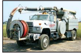
87 Ford F-800 4x4 Sewer Jetter

1987 FORD Model F-800, 4x4, Sewer Jetter Truck , Ford 6 cylinder, 210HP diesel and 5 speed trans, vactor body Ford 6 cylinder gas, water tanks, hydraulic dumping hopper, hydraulic positioning boom, front hydraulic reel, air brakes, dual rear wheels, and 11.00R20 tires. In good condition with good tires.