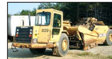
97 Cat 613C Series II