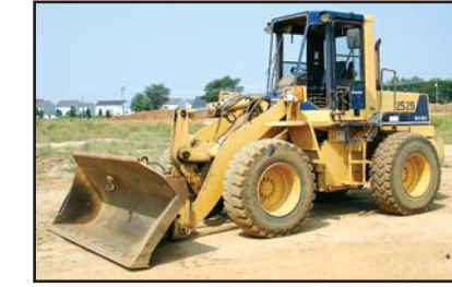
97 Komatsu WA180-1

ATTACHMENTS: (2) JRB 70" Fork Attachments • JRB 60" Fork Attachment • BALDERSON 60" Fork Attachment • JRB A180, 58" Fork Attachment (Fits WA180) • Hydraulic Side Dump Bucket (Fits Komatsu WA380) • Side Dump Bucket (Parts - No Hydraulics)