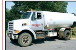
'98 Ford L8500 with Allied Fuel Body

1998 FORD Model L8500 Single Axle Fuel Truck , Cummins 8.3C, 225HP diesel (Cummins Recon 2005) and Allison automatic trans, Allied 2,500 gallon aluminum fuel body, hose reel and meter, air brakes, air conditioning. In good condition.