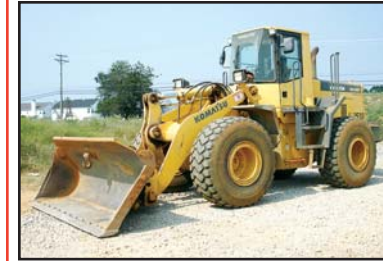
02 Komatsu WA380-3MC sn A51533