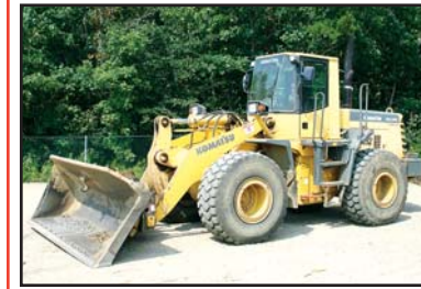
02 Komatsu WA380-3MC sn A51532