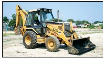
(1) of (2) '96 Cat 416B 4x4

1996 CATERPILLAR Model 416B, 4x4 Tractor Loader Extend-A-Hoe , s/n 8ZK09543, Cat diesel and shuttle trans, general purpose loader bucket with bolt-on cutting edge, 24" digging bucket, enclosed ROPS cab, 12.5/80x18 front and 19.5Lx24 rear tires. In fair to good condition with fair to good tires.