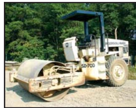
'89 Ingersoll Rand SD-70D

1989 INGERSOLL RAND Model SD-70D Vibratory Compactor , s/n 5071S, Cummins 4-53 diesel and hydrostatic trans, 66" smooth drum, drum drive, ROPS canopy, and 14.9x24 tires. In good condition with good tires.