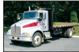
06 Kenworth T300

2006 KENWORTH Model T300 Single Axle Flatbed Truck , Cat C-7, 300HP diesel and Allison automatic trans, 18'6" flatbed with bulkhead and stake pockets, 23,000# rear, air brakes, snowplow package, air brakes, tow package with air, spring suspension, air conditioning, cruise control, power windows, 11R22.5 tires, and 33,000# GVWR. In good condition with good tires.