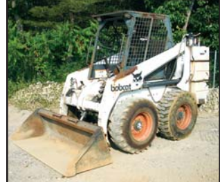
'95 Bobcat 853H

1995 BOBCAT Model 853H Skid Steer Loader , s/n 512818830, Isuzu diesel and hydrostatic trans, Hi-Flow hydraulics, 67" general purpose loader bucket, ROPS canopy, and 12x16.5NHS tires. In good condition with fair to good tires. MELROE 18" cold planer attachment, MELROE Model Sweeper 60, 60" Hydraulic Broom with hopper FORD Model Utility Broom Tractor , s/n Unknown, Ford diesel and direct drive trans, MB 66" hydraulic broom with power angle, live PTO, water tank. In fair to good condition with fair to good tires.