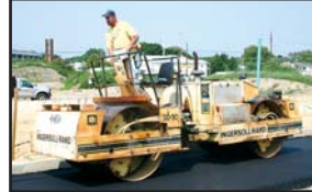
'88 Ingersoll Rand DD-90

1999 INGERSOLL RAND Model DD-32 Vibratory Roller , s/n 158929, Deutz F3L1011F diesel and hydrostatic trans, 48" smooth drums, water system, and ROPS post. In fair to good condition.