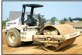
'97 Ingersoll Rand SD-115D

1997 INGERSOLL RAND Model SD-115D ProPac Vibratory Compactor , s/n 149186, Cummins 5.9 liter diesel and hydrostatic trans, 84" smooth drum, drum drive, ROPS canopy, and 23.1x26 tires. In good condition with good tires.