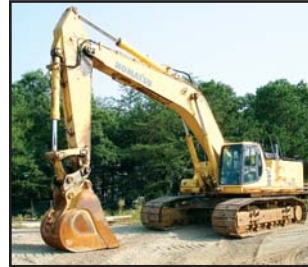
00 Komatsu PC600LC-6K

ATTACHMENTS: LABOUNTY 5-Tine Grapple (PC300) Digging Buckets: PC400 – ESCO 68"; 60"; (2) 30" • PC600 – BATEMAN 36" • PC300 – ESCO 54" • GEITH 24" • Cat 235 – (2) 48" • 24"