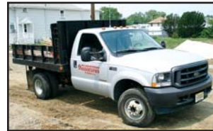
03 Ford F-350XL 4x4 Masonry

2003 FORD Model F-350XL Super Duty, 4x4 Masonry Flatbed Truck , Powerstroke V-8 Turbo diesel and automatic trans, 10' flatbed with 18" steel stake sides, headache rack, 100 gallon water tank, dual rear wheels, tow package with electric, air conditioning, and 285/85R16 tires. In good condition with good tires.