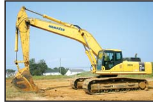
05 Komatsu PC400LC-7L

2005 KOMATSU Model PC400LC-7L Hydraulic Excavator , s/n A86370, Komatsu diesel and hydraulic drive, 11' dipper stick, Esco 42" digging bucket, Galeo package, air conditioning, 17'6" crawlers, and 35.5 TBG pads. In good condition with good undercarriage. (Offered Subject To Creditor's Immediate Confirmation-Please Refer To Bankruptcy Notice On Rear Panel)