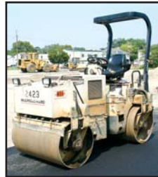
'99 Ingersoll Rand DD-32