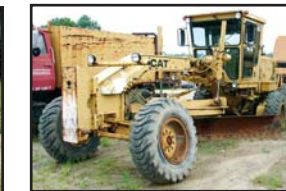
89 Cat 12G