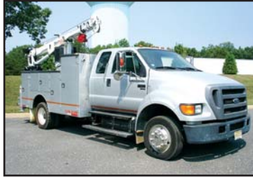
04 Ford F-650XL

2004 FORD Model F-650XL Super Duty Single Axle Quad Cab Service Truck , Cat 3126 diesel and 7 speed trans, Curry Supply 11' service body with 24" work station bumper, Stellar model 6620/WFLIP, 6,000# hydraulic service crane, s/n GBX03187, with 10'9"-20'9" 3-section boom and (2) hydraulic outriggers, Vanair model 60 Viking 150CFM PTO powered air compressor, Getec model 250-5.5, 250 amp/5500 watt welder/generator, oxygen/acetylene torch set, air conditioning, cruise control, 245/70R19.5 tires, and 24,000# GVWR. In good to very good condition with fair tires.