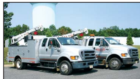
'04 FORD F-650XL SERVICE TRUCKS