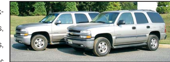
(2) of (3) 03 Chevy Tahoe 4x4

1999 FORD Model Escort Wagon , 4 cylinder gas and automatic trans. In good condition with good tires.