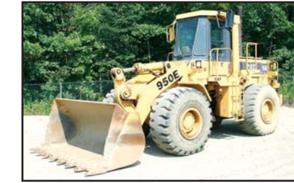
88 Cat 950E