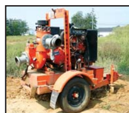
03 Godwin CD100 4 Inch Dri-Prime

GLOBAL PUMP CO. Model 6-TAP-J4-T, 6" Portable Pump , s/n 9943702, John Deere 4.5 liter diesel. In good condition.