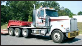
'01 Western Star

2001 WESTERN STAR Model 4964EX Tri-Axle Truck Tractor , Cat C-15, 475HP diesel and Eaton Fuller 8LL, RTO16908LL, 10 speed trans, 48,000# rears, 20,000# lift axle, 16,000# front axle, 228" wheelbase, wetline kit, air slide 5th wheel, double frame, 3-stage brake, Diamond plate fenders, toolboxes, front aluminum Buds, twin 71 gallon aluminum fuel tanks, air conditioning, cruise control, power windows, heated mirrors, 315/80R22.5 front tires, 11R24.5 rear tires, and 295/75R22.5 lift axle. In good condition with good tires. (Offered Subject To Creditor's Immediate Confirmation-Please Refer To Bankruptcy Notice On Rear Panel)