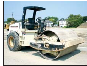
'98 Ingersoll Rand SD-115D

1998 INGERSOLL RAND Model SD-115D ProPac Vibratory Compactor , s/n 154281, Cummins 5.9 liter diesel and hydrostatic trans, 82.5" smooth drums, drum drive, ROPS canopy 23.1x26 tires. In good condition with fair to good tires.