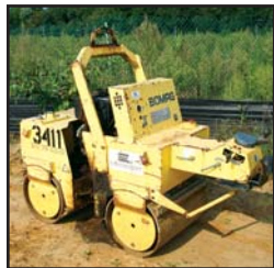
(1) of (4) Bomag BW75AD

1990 SAKAI Model SV200TB Vibratory Padfoot Compactor , s/n VSV3T-10126, 4 cylinder diesel and hydrostatic trans, 49" padfoot drum with drum cleaners, drum drive, 66" backfill blade, and 11.2x20 tires. In good condition with fair tires.