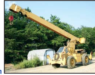
Austin Western 9 Ton

1975 CATERPILLAR Model T50B, 5,000# Solid Tired Forklift , s/n 12N1979, propane gas and shuttle trans, 3-stage mast and 42" forks. In fair to good condition.