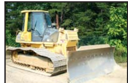
01 Komatsu D61PX-12 sn B1685

2004 CATERPILLAR Model D4G LGP Crawler Tractor , s/n TLX00395, Cat 3046 diesel and powershift trans, 6-way straight blade, joystick steering, enclosed ROPS cab with air conditioning, and 25" SBG pads. In good condition with fair undercarriage.