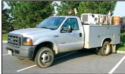
05 Ford F-350XL 4x4

2005 FORD Model F-350XL Super Duty 4x4 Service Truck , Powerstroke 6.0L diesel and automatic trans, Reading 9' open utility body, IMT model DA435HA, PTO powered air compressor, air conditioning, dual rear wheels, and 235/85R17 tires. In good to very good condition with fair tires.