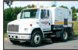
02 Elgin FL42H on 01 Freightliner FL70

2002 ELGIN Model FL42H Mobile Sweeper , s/n Unknown, Cat 3126, 230HP diesel and automatic trans, 5' rear center broom, (2) 32" gutter brooms, dump hopper, water system with front, side, and rear spray, mounted on 2001 Freightliner Model FL70 Single Axle Carrier, dual operator stations, air brakes, air conditioning, and cruise control. In good condition with fair to good tires.