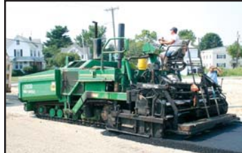
'98 Barber Greene BG-245C

1998 CATERPILLAR/BARBER GREENE Model BG-245C Crawler Asphalt Paver , s/n 4XN00116, Cat 3116 diesel and hydrostatic trans, Cat/B-G Extend-A-Mat 10-20B, 10'-20' hydraulic extendable heated screed, auto grade and slope controls, crown control, washdown system, 14" poly pads. In good condition with good undercarriage.