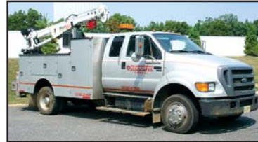
04 Ford F-650XL

2004 FORD Model F-650XL Super Duty Single Axle Quad Cab Service Truck , Cat 3126 diesel and 7 speed trans, Curry Supply 11' service body, s/n 901031, with 24" work station bumper, Stellar model 6620, 6,000# hydraulic service crane with 3-section boom and (2) hydraulic outriggers, Vanair model 60 Viking 150CFM PTO powered air compressor, Getec model 250-5.5, 250 amp PTO powered welder, air conditioning, 245/70R195 tires, and 24,000# GVWR. In good condition with good tires.