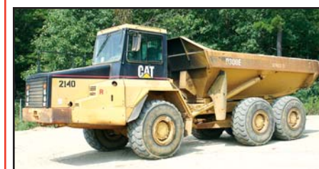
00 Cat D300E Series II 6x6

2000 CATERPILLAR Model D300E Series II, 30 Ton, 6x6 Articulated End Dump , s/n 5KS00537, Cat diesel and powershift trans, supplemental steering, heated body (not plumbed), air conditioning, and 23.5R25 tires. In good condition with fair to good tires.