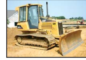
04 Cat D4G LGP sn TLX00508

2004 CATERPILLAR Model D4G LGP Crawler Tractor , s/n TLX00508, Cat 3046 diesel and powershift trans, 6-way straight blade, enclosed ROPS cab with air conditioning, and 25" SBG pads. In good condition with fair undercarriage. (Offered Subject To Creditor's Immediate Confirmation-Please Refer To Bankruptcy Notice On Rear Panel)