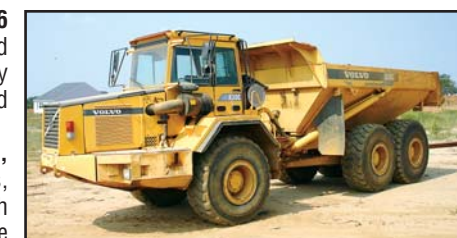
98 Volvo A30C 6x6

1998 VOLVO Model A30C, 30 Ton, 6x6 Articulated End Dump , s/n A30CV60066, Volvo diesel and powershift trans, air conditioning and 23.5R25 tires. In good condition with good tires. (Offered Subject To Creditor's Immediate Confirmation-Please Refer To Bankruptcy Notice On Rear Panel)