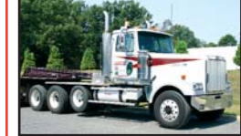
'04 Western Star

2004 WESTERN STAR Model 4984EX Tri-Axle Truck Tractor , Cat C-15, 475HP diesel and Eaton Fuller 8LL, 10 speed trans, 50,000# rears, 20,000# lift axle, 16,000# front axle, 230" wheelbase, wetline kit, air slide 5th wheel, 3-stage brake, double frame, Diamond plate fenders, headache rack, toolboxes, aluminum front Buds, single 95 gallon aluminum fuel tank, air conditioning, cruise control, power windows, heated mirrors, 315/80R22.5 front tires, 11R24.5 rear tires, and 275/70R22.5 lift axle. In good condition with good tires.