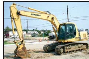
01 Komatsu PC150LC-6K