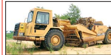
98 Cat 613C Series II