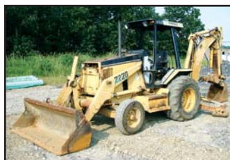
'92 Cat 416B

1996 CATERPILLAR Model 416B, 4x4 Tractor Loader Backhoe , s/n 8ZK08612, Cat diesel and shuttle trans, general purpose loader bucket with bolt-on cutting edge, 22" digging bucket, enclosed ROPS cab, 12.5/80x18 front and 19.5L-24 rear tires. In good condition with fair tires.