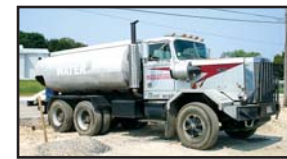
'87 Autocar with Allied 3,100 Gallon Water Body

1987 AUTOCAR (Volvo/White) Tandem Axle Water Truck , Cummins NTC400BC3, 400HP diesel and Fuller 8LL, Allied 3,100 gallon aluminum water body, hydraulic discharge pump, rear air actuated spray heads, 12R24.5 tires, and 80,000# GVWR. In fair to good condition. (Off-Road Use Only)