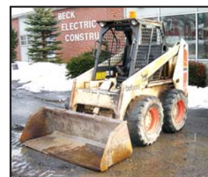
'86 BOBCAT 843