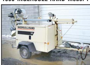
'97 INGERSOLL RAND

REEVES 140 Gallon Portable Tar Pot , equipped with propane heater and 185/75R14 tires. In fair condition with fair tires.