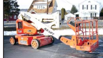
'95 JLG N40

1995 JLG Model N40 Electric Aerial Lift , s/n 0174050300021001, powered by 480 volt, 8EA-6V battery and electric drive motors, equipped with 40' maximum platform height, 20'6" horizontal reach, 26"x48" 500# man/material basket, hydraulic basket swing and leveling, and 22x6x18 solid tires. In good condition with good tires.