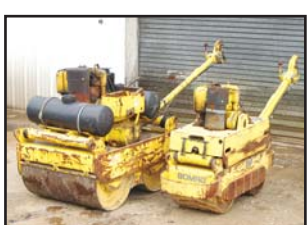
BOMAG TRENCH COMPACTORS

BOMAG Walk-Behind Tandem Roller , s/n 101020224472, powered by 1 cylinder diesel engine and hydrostatic transmission, equipped with 29.5" smooth drums and water system. In good condition.