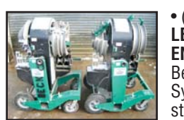
GREENLEE 555 SMART BENDERS