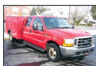
'00 FORD F350XLT

2000 FORD Model F-350XLT Super Duty Crew Cab Mechanics Truck , powered by Powerstroke 8 cylinder diesel engine and 6 speed transmission, equipped with 8' open mechanics body with 1"6" aluminum work bumper, power windows and locks, cruise control, AM/FM cassette/CD, and 235/85R16 tires. In good condition with good tires.