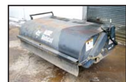
BOBCAT SWEEPER 72