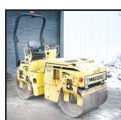
'98 WACKER RD25

1998 WACKER Model RD25 Double Drum Vibratory Roller , s/n 5014243, powered by Hatz 2 cylinder diesel engine and hydrostatic transmission, equipped with 43" smooth drums, drum cleaners, water system, open ROPS canopy, and light package. In good condition.