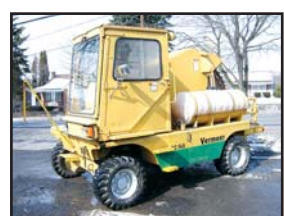
88 VERMEER CC-135

1988 VERMEER Model CC-135 Earth Saw , s/n 1VRF122V9J1000232, powered by Detroit 3 cylinder diesel engine, equipped with approx. 8' earth saw with hydraulic raise and lower, 3' digging depth, water system, (2) 100 gallon poly water tanks, air conditioning, light package, and 12-16.5 tires. In good condition with good tires.