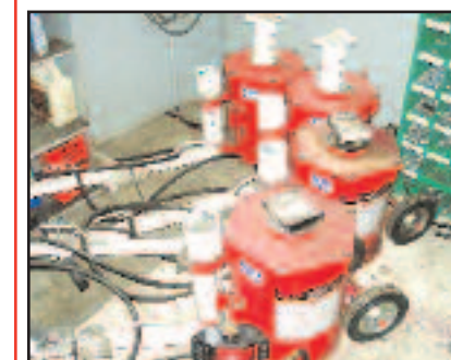
NORCO 10 TON JACKS

Rolling Shop Gantry, with 3-ton hoist and 14' span • (4) NORCO 10 Ton Portable Pneumatic Jacks • MACK 22 Ton Portable Pneumatic Jack • 20 Ton Portable Pneumatic Jack • Transmission Jack • Wheel Dolly • INGERSOLL RAND 1" Impact Wrench • MAC 3/4" Impact Wrench • Impact Sockets • 1997 KARCHER 2,000PSI Pressure Washer , with heat, 220 volt • 55 Gallon Super Clean De-Greaser • COLEMAN 5,000 Watt Generator • HONDA 2500 Watt Generator • UNIVERSAL Bead Blast Cabinet • Pneumatic Lubers • Grease Guns • Floor Jacks • Work Lights • (2) Engine Hoists • (3) Pallet Jacks • (3) Rolling Stairs • Fiberglass Ladders To Include: (12) 6'; (2) 4'; (4) 2'; (1) 7' • Drills • Grinders • Jig Saws • (6) Shop Vacs • Tool Boxes • Bolt Bins • Hardware • Horizontal Shop Air Compressor, 10HP, 220 volt, 3-phase