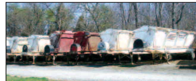
SIDE DUMP FERTILIZER TRAILERS