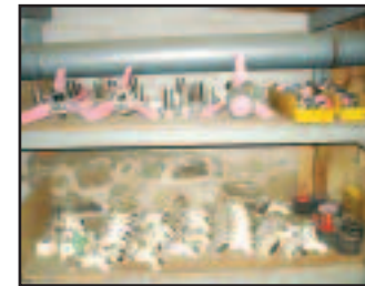
BOOM HANGERS AND ATOMIZERS

Rotary Atomizers And Spray Nozzles: (40+/-) Micronair Model AU5000 & Beecomist Model E-360AL Rotary Atomizers, Some With Mosquito Sleeves • (100+/-) .028 Nozzles • (500+/-) Single, Double And Triple Row Microfoil Comb Nozzles, Sizes .013-.025 • Assorted 8002, 8003 & 8004 Brass, Stainless And Stainless Insert Nozzles • Nozzle Bodies And Various Parts