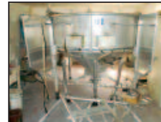
(1) OF (2) ALUMINUM FERTILIZER BUCKETS

Hook Assemblies And Cargo Nets: (4) Remote Hook Assemblies (206) • (1) Remote Hook Assembly (UH-1) • (5) Hook Assemblies (206) • (2) Under-Frames (206) • (3) Individual Hooks • (4) 206 & (2) UH-1 Cargo Nets • (4) Cargo Nets With Small Netting And (4) With Large Netting • (2) Air Rescue Nets • (4) UH-1 Hook Cage W/O Hooks • (4) 50 Ft & (1) 100 Ft Long Lines (206) • (3) 100 Ft & (3) 50 Ft & (1) 25 Ft Long Lines (UH-1) • Various Shackles, Chokers And Long Lines