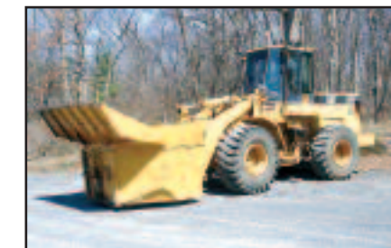
'94 CAT 938F