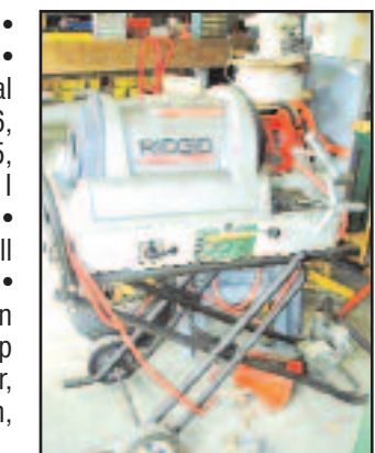
RIDGID 1822 POWER THREADER

LINCOLN Precision Tig 275 , 275 Amp AC/DC TIG Welder, s/n U1030617707 • AIRCO 250 Amp AC/DC Arc Welder • UNI-HYDRO Iron Worker , s/n 1P4573X • RIGID 1822-I Power Threader , s/n EA13227L95 • NATIONAL U7216 Manual Brake , s/n 1U-3-88, 16 gauge • NATIONAL N5216 , 52" Jump Shear, 16 gauge • 2005 GRIZZLY G0555 , 14" Band Saw, 110 volt • MARVEL Series 8-Mark I Metal Band Saw , s/n 820698, 208V/3-phase • DAYTON Belt/Disc Sander , 110 volt • DAYTON 20" Drill Press , 110 volt, 5/8" chuck • DAYTON Drill Press • MEYER 25 Ton Manual Shop Press • DAYTON 12 Ton Manual Shop Press • SUNNEN 10 Ton Electric Shop Press • 4 Ton Pneumatic Shop Press • Pedestal Grinder, 220 volt • Welding/Cutting Table • Steel, Aluminum, Stainless, Stock and Sheet Metal