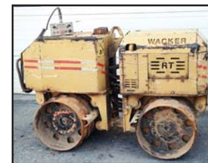
'96 WACKER RT820

MUELLER B-100 Tapping Machine • RICE DP-2B Hydrostatic Test Pump • WACKER Vibratory Plate Compactor • WACKER BS500 Foot Compactor • MIKASA MT65H Jet Compactor • MIKASA MT75HS Foot Compactor • (2) INGERSOLL RAND Paving Breakers • JET 60# Rock Drill • (3) EMGLO Air Compressors • (2) MILLER AEAD-200LE Gas Powered Welders • HOBART AGH-27 Mig Welder • WINCO Gas Powered Generator • (2) HONDA Gas Powered Generators • (2) HONDA 5000 Watt Generators • STOW DP80, 3" Diaphragm Pump • STOW 1-1/2" Submersible Pump • STOW 1" Submersible Pump • (2) WAYNE 1-1/2" Pumps • WACKER 2" Submersible Pump • FLYGT 2" Submersible Pump • HONDA 2" Trash Pump • HONDA 3" Trash Pump • 16", 12", and 8" Pipe Grabs • MACDONALD DM11S Demo-Pick Hoe Attachment • Assorted WACKER & STOW Foot Compactors (Parts Only) • (3) Table Saws • (2) Fuel Oil Fired Unit Heaters • (5) STONE 150,000 BTU Silent Gas Heaters • STAR MAN Platform Lift for Forklift • JENNY Power Washer • Sand Blaster • (24) 100# Bags of Sandblasting Sand • Approximately (90) 12'x8' Pieces of Security Fence & Stands • Assorted Ladders • Scaffolding • Construction Lamps • Construction Carts • (2) Pickup Caps • Assorted Pickup Tool Boxes • Pickup Mounted Fuel Tank • 225 Gallon Fuel Tanks • 550 Gallon Fuel Tank, with electric pump