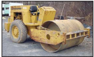
'87 DYNAPAC CA15D