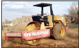
'96 DYNAPAC CA251D

1996 DYNAPAC Model CA251D Vibratory Compactor , s/n 58312923, powered by Cummins 5.9B diesel engine and hydrostatic transmission, equipped with 84" smooth drum, drum drive, ROPS canopy, and 23.1x26 tires. In good condition with good tires. (Purchased New) 1987 DYNAPAC Model CA15D Vibratory Compactor , s/n 2130S17, powered by John Deere 4239DF, 4 cylinder diesel engine and hydrostatic transmission, equipped with 66" smooth drum, drum drive, and 14.9x24 tires. In good condition with good tires.