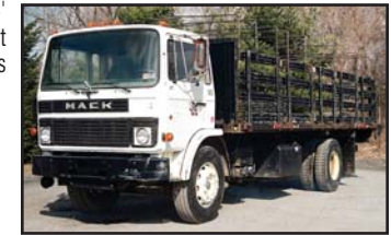
'86 MACK MS200P

1986 MACK/RENAULT Model MS200P Single Axle Cab Over Stake Body Truck , powered by Renault diesel engine and 5 speed transmission, equipped with 24' flatbed, stake sides, lift gate, spring suspension, ratchet tie-downs, and 11R22.5 tires. In good condition with good tires