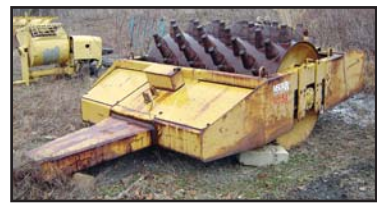
VIBRO PLUS CF43

VIBRO-PLUS Model CF43 Tow Behind Vibratory Sheepfoot Compactor , s/n 43CF437, powered by Deutz 3 cylinder diesel engine, equipped with 75" padfoot drum. In good condition.