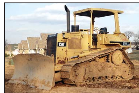
96 CAT D5HXL