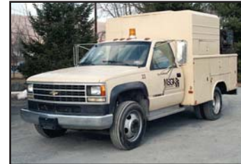
'91 CHEVY 3500HD

1991 CHEVROLET Model 3500HD Mechanics/Lube Truck , powered by V-8 gas engine and automatic transmission, equipped with Reading 9" mechanics lube body with enclosed lube body, gas powered air compressor, Miller Bluestar model 180K, 180 amp welder/5,000 watt generator, powered by Kohler 12.5HP gas engine, (3) product tanks with pneumatic pumps and hose reels, oxygen/acetylene torch set, dual rear wheels, AM/FM stereo, and 225/70R19.5 tires. In good condition with good tires. (Purchased New)