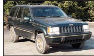
'94 JEEP 4X4

1986 CHEVROLET Model S10 Pickup Truck , automatic transmission. (Not Running) 1988 CHEVROLET Model 1500, 4x4 Pickup Truck , automatic transmission. (Not Running) 1991 CHEVROLET Model 1500 Scottsdale 4x4 Pickup Truck , V-8 gas engine and automatic transmission (Steering Column Removed) (Parts Only)