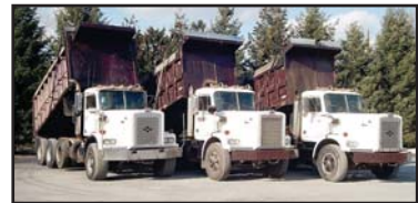
(3) '89-'87 DIAMOND REO'S

1989 DIAMOND REO Model Giant C11664DB Tri-Axle Dump Truck , powered by Cummins LTA10, 300HP diesel engine and Eaton Fuller 8L, 10 speed transmission, equipped with Giant 17' steel dump body with coal chute and tarp, airlift 3rd axle, 2-position Jake brake, spring suspension, tow package with air, 425/65R22.5 front, 9.0R20 lift, and 11R22.5 rear tires. In good condition with good tires. (Rebuilt Engine)