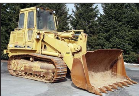
97 CAT 963B