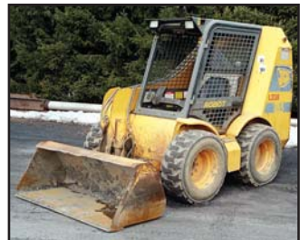
'96 JCB ROBOT 185

1996 JCB Model Robot 185 Skid Steer Loader , s/n SLP185SATE0746093, powered by Perkins 4 cylinder diesel engine and hydrostatic transmission, equipped with 66" general purpose loader bucket with bolt-on cutting edge, quick disconnect, auxiliary hydraulics, light package, and 12x16.5 tires. In good condition with good tires. (Purchased New)