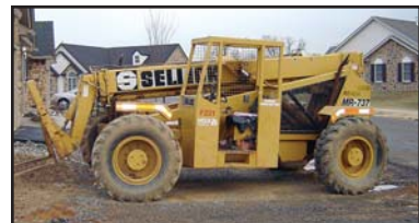
'88 SELLICK MR-737

1988 SELLICK Model MR-737, 7,000#, 4x4 Telescopic Rough Terrain Forklift , s/n 165058737, powered by Perkins diesel engine and powershift transmission, equipped with 37" maximum lift, 48" forks, 3-stage telescopic boom, 4-wheel steer, chassis tilt, 22,510# operating weight, and 13.00x24 tires. In fair to good condition with fair to good tires.