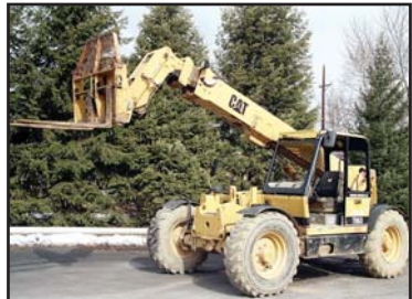
'97 CAT TH63

1997 CATERPILLAR Model TH63, 6,000#, 4x4 Telescopic Rough Terrain Forklift , s/n 3NN00674, powered by Cat 3054 diesel engine and powershift transmission, equipped with 41" max lift height, 48" forks, 3-stage telescopic boom, hydraulic quick disconnect with manual pin, 4-wheel steer, chassis tilt, light package, and 13.00x24 tires. In good condition with good tires. (Purchased New)