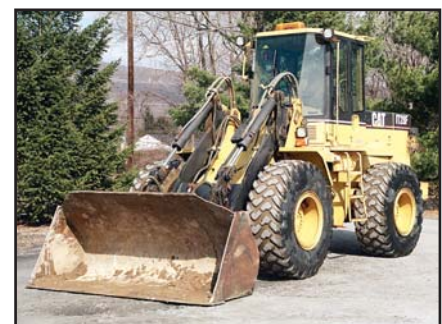
96 CAT IT28F