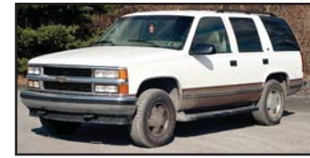
'98 CHEVY TAHOE 4X4

1998 CHEVROLET Model Tahoe 4x4 Sport Utility Vehicle , powered by V-8 gas engine and automatic transmission, equipped with leather interior, full power package, air conditioning, AM/FM CD, tow package, and 245/75R16 tires. In good condition with good tires. (Purchased New)