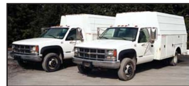
'99 CHEVY 4X4'S

1999 CHEVROLET Model 3500, 4x4 Utility Truck , powered by V-8 gas engine and 5 speed transmission, equipped with Stahl 11' walk-in utility body, side boxes, rear work lights, dual rear wheels, AM/FM stereo, pintle hitch, and LT225/75R16 tires. In good condition with fair tires. (Purchased New)