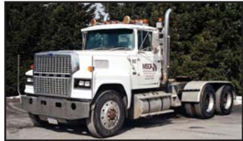
'86 FORD LTL9000

1986 FORD Model LTL9000 Tandem Axle Truck Tractor , powered by Cat 3406, 425HP diesel engine and Fuller Roadranger 15 speed transmission, equipped with double frame, wetline, 2-position Jake brake, spring suspension, air slide 5th wheel, aluminum front Budd wheels, (2) 105 gallon aluminum fuel tanks, aluminum headache rack with work lights, and 11R24.5 tires. In good condition with fair to good tires.