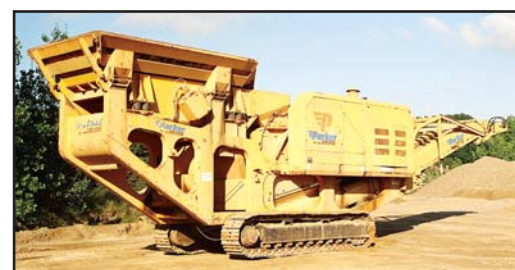
'98 PARKER RT1163DH