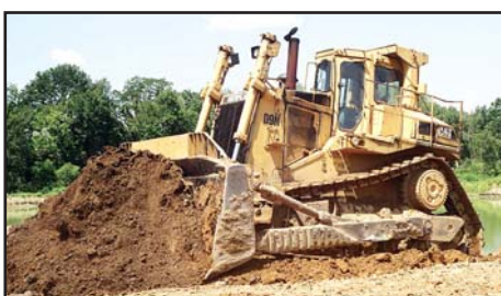
'89 CAT D9N