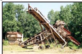
'92 SCREEN MACHINE

1992 SCREEN MACHINE Portable Screening Plant , s/n 45D46-3-9B382, powered by Deutz 3 cylinder diesel engine, equipped with 10'x5' feed hopper with manual raise and lower grizzly, 24"x8' bottom feed conveyor, 24"x approx. 35' hydraulic folding feed conveyor with hydraulic raise and lower, 4'x6' double deck vibrating screen, 8' discharge roll-off chute, and 8.50-16.5 tires. In good condition with good tires. (Purchased New)