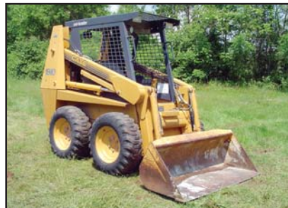
'96 CASE 1840

1440 COWPATH RD. • HATFIELD, PA 19440 215/361-9099 • Fax: 215/361-9212