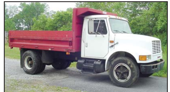
'92 INT'L 4700 SINGLE AXLE