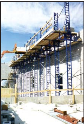
MASON KING ADJUSTABLE SCAFFOLDING

PRE-SORTED FIRST CLASS MAIL US POSTAGE PAID HAVERTOWN, PA PERMIT #45