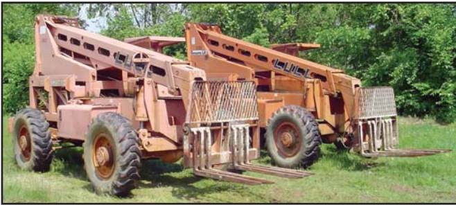
(2) LULL 6,000# 4X4

1990 GEHL DYNALIFT Model 663, 6,000#, 4x4 Telescopic Rough Terrain Forklift , s/n JG024155, JD 4045T diesel engine, equipped with 28' 3-section boom, 37' fork height, fork rotation, 48" block forks, manual quick disconnect, and EROPS. In good condition. (Purchased New)