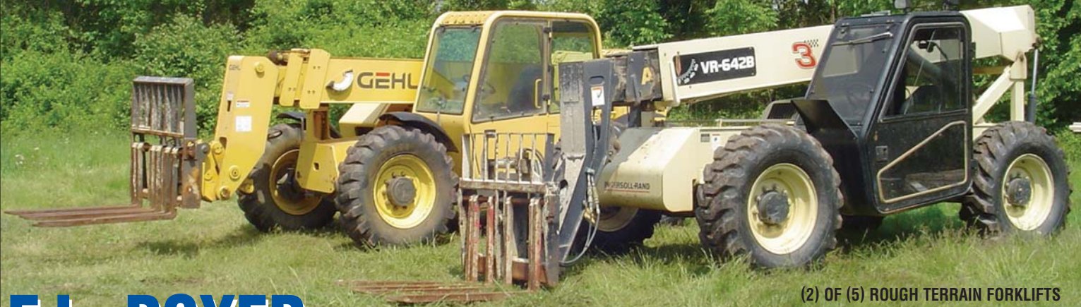
(2) OF (5) ROUGH TERRAIN FORKLIFTS