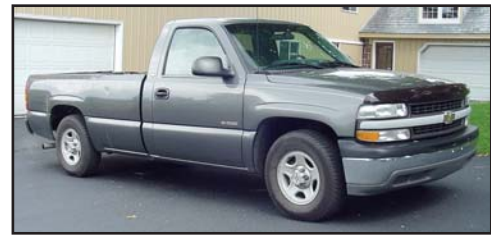
'99 CHEVY 1500

1992 INTERNATIONAL Model 4700 Single Axle Mason's Dump Truck , International DT466 diesel engine and 5 speed transmission, equipped with 13' body with 16" folding sides and 10R22.5 front and 11R22.5 rear tires. In good condition • 1999 CHEVROLET Model 1500 Silverado Pickup Truck , V-6 gas engine and automatic transmission, equipped with 8' bed, air conditioning, and 235/75R16 tires. In good condition • 1987 CHEVROLET Model Custom Deluxe 20 Pickup Truck , V-8 gas engine and automatic transmission, equipped with 8' bed, plow frame, and 235/85R16 tires. In fair condition • Western 7'6" Snow Plow • 1978 KENTUCKY 40' Van Trailer . In fair condition.