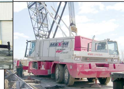
#1627 LINK-BELT HC218A