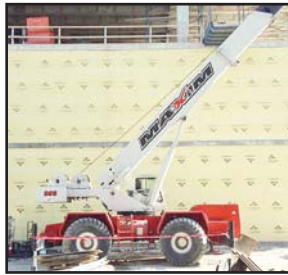
#865 '92 LINK-BELT HSP8050

#865 1992 LINK-BELT Model HSP8050, 50 Ton Hydraulic Rough Terrain Crane, s/n 5312-597, powered by Cummins 8.3L diesel engine and powershift transmission, equipped with 35'-110' 4-section boom with 25' power pin fly, 33' swingaway jib, main and auxiliary hoists, LMI system, anti-two block system, (4) hydraulic outriggers, and 29.5x25 tires. In good condition with good tires. (Maxim)