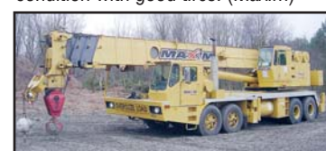
#0453 '93 GROVE TMS875B

(4) 1991 LINK-BELT Model HTC-840, 40 Ton Hydraulic Truck Cranes, s/n 6411-0611 (#1360); s/n 6411-612 (#1361); s/n 6411-613 (#1362); s/n 6411-614 (#1363), equipped with 35'-110' 4-section boom with 25' power pin fly, 33' swingaway jib, single drum, LMI system, anti-two block system, hook block and ball, mounted on 8x4 carrier, powered by Cummins 6CTA-8.3 recon diesel engine and Eaton Fuller Roadranger RTO-6613, 13 speed transmission, with (4) hydraulic outriggers, front stabilizer, and 385/65R22.5 steering axle and 11.00R20 rear tires. In good condition with good tires. (Maxim)