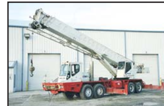
#1565 '91 LINK-BELT HTC860