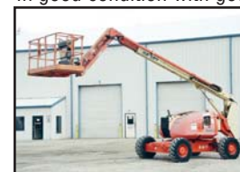
#A1223 '98 JLG 600AJ

#A746 1996 GROVE Model AMZ68XT, 62' 4x4 Aerial Lift, s/n 36726, powered by Deutz diesel engine and hydraulic drive, equipped with 2-man basket, articulated boom, and 15x19.5 foam filled tires. In good condition with good tires. (Maxim)