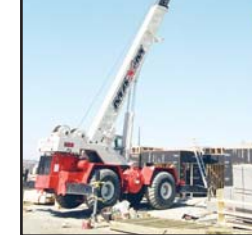
#1129 '94 LINK-BELT HSP8050

#1129 1994 LINK-BELT Model HSP8050, 50 Ton Hydraulic Rough Terrain Crane, s/n 5314-1934, powered by Cummins 8.3L, 6 cylinder diesel engine and powershift transmission, equipped with 35'-110' 4-section boom with 25' power pin fly, 33' swingaway jib, main and auxiliary hoists, Microguard 414 LMI system, (4) hydraulic outriggers, and 29.5x25 tires. In good condition with good tires. (Maxim)