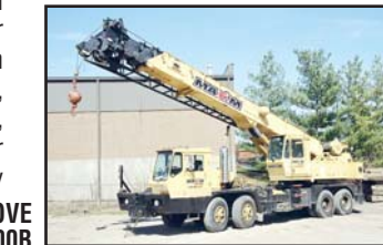
#457 '86 GROVE TMS300B