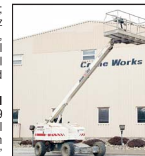
#A1561 '99 TEREX TB44

(2) 1998 TEREX Model TB44, 44' 4x4 Aerial Lift, s/n 98610135 ( #A1232 ); s/n 98610139 ( #A1253 ), powered by Deutz 3 cylinder diesel engine and hydraulic drive, equipped with 600# capacity man/material basket, 36"x96" platform, 37' horizontal reach, and 12x16.5 foam filled tires. In good condition with good tires. (Maxim)