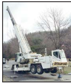
#1361 '91 LINK-BELT HTC840

#457 1986 GROVE Model TMS300B, 40 Ton Hydraulic Truck Crane, s/n 69010, equipped with 34'-104' 4-section boom with 25' power pin fly, 32' swingaway jib, main and auxiliary hoists, Kruger LMI system, mounted on Grove model 8440G, 8x4 carrier, s/n DP1SS27002DI, powered by Cat 6 cylinder diesel engine and Fuller 13 speed transmission, equipped with (2) 23,746# front and (2) 46,000# rear axles, (4) hydraulic outriggers, front stabilizer, and 12.00R20 front and 11.00R20 rear tires. In good condition with good to very good tires. (Maxim)