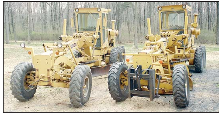
CHAMPION 720 & 715

JOHN DEERE Model 770 Articulated Motor Grader , s/n 0052031, powered by John Deere diesel engine and powershift transmission, equipped with 12' hydraulic moldboard, enclosed ROPS cab, light package, and 14.00-24 tires. In fair condition with fair to good tires. CHAMPION Model 720 Motor Grader , s/n 720-53-103-0888-2, powered by Detroit 4 cylinder diesel engine and powershift transmission, equipped with 12' hydraulic moldboard, scarifier (no teeth), enclosed cab with heat, light package, and 14.00-24 tires. In good condition with good tires. CHAMPION Model 715 Motor Grader , s/n 715-14-234-13212, powered by Detroit 4 cylinder diesel engine and powershift transmission, equipped with 12' hydraulic moldboard, scarifier, enclosed cab with heat, light package, and 13.00-24 tires. In good condition with good tires. GALION Model 503G Motor Grader , s/n Unknown, direct drive. In fair condition with fair tires.