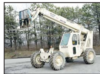
#A1554 '99 TEREX SS842