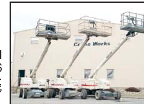
(3) OF (13) TEREX TB44's

(10) 1999 TEREX Model TB44, 44' 4x4 Aerial Lift, s/n 99610087 ( #A1409 ); s/n 99610106 ( #A1438 ); s/n 99610108 ( #A1440 ); s/n 99610109 ( #A1441 ); s/n 99610097 ( #A1559 ); s/n 99610098 ( #A1560 ); s/n 99610105 ( #A1561 ); s/n 99610129 ( #A1562 ); s/n 99610145 ( #A1734 ); s/n 99610146 ( #A1735 ), powered by Deutz 3 cylinder diesel engine and hydraulic drive, equipped with 600# capacity man/material basket, 36"x96" platform, 37' horizontal reach, and 12x16.5 foam filled tires. In good condition with good tires. (Maxim)