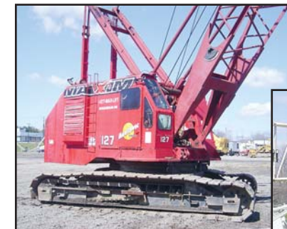
#127 MANITOWOC 3900