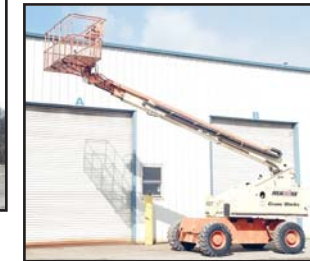
#A637 '96 JLG 60H

#A637 1996 JLG Model 60H, 60' 4x4 Aerial Lift, s/n 025076 0300024773, powered by Deutz 3 cylinder diesel engine and hydraulic drive, equipped with 500# capacity man/material basket, 36"x93" platform, 50' horizontal reach, and 15x19.5 tires. In good condition with good tires. (Maxim)