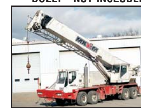
#1360 '91 LINK-BELT HTC840