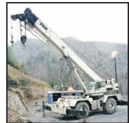
#901 '93 P&H CN150