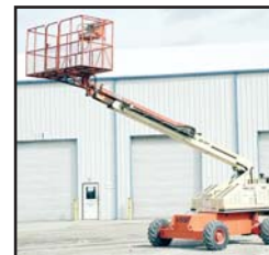
#A590 '95 JLG 40H

#A590 1995 JLG Model 40H, 40' 4x4 Propelled Aerial Lift, s/n 0251980300023446, powered by Deutz 3 cylinder diesel engine and hydraulic drive, equipped with 500# capacity man/material basket, 36"x96" platform, 33' horizontal reach, and 12.5Lx15 tires. In good condition with fair tires. (Maxim)