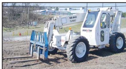
#A1528 '99 TEREX SS842

(2) 1999 TEREX Model Square Shooter SS842, 8,000# 4x4 Telescopic Rough Terrain Forklifts, s/n 991915 ( #A1554 ); s/n 991912 ( #A1528 ), powered by Cummins B3.9-C diesel engine and powershift transmission, equipped with 22' 3-section hydraulic boom, 42' fork height, 48" forks, mast tilt, fork rotation, cab leveling, 4-wheel steer, enclosed ROPS cab with heat, light package, and 13.00x24 foam filled tires. In good condition with good tires. (Maxim)