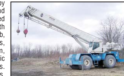
#863 '92 LINK-BELT HSP8050

#863 1992 LINK-BELT Model HSP8050, 50 Ton Hydraulic Rough Terrain Crane, s/n 5312-594, powered by Detroit 6V-71 diesel engine and powershift transmission, equipped with 35'-110' 4-section boom with 25' power pin fly, 33' swingaway jib, main and auxiliary hoists, Microguard 424 LMI system, (4) hydraulic outriggers, and 29.5-25 tires. In good condition with good tires. (Maxim)