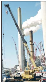
#855 '90 GROVE RT745

#259 1988 P&H Model CN150, 50 Ton Hydraulic Rough Terrain Crane, s/n 54373, powered by Cummins 8.3L diesel engine and powershift transmission, equipped with 35'-110' 4-section boom with 25' power pin fly, 35' swingaway jib, main and auxiliary hoists, PAT anti-two block system, hook block, (4) hydraulic outriggers, and 26.5-25 tires. In good condition with good tires. (Maxim)