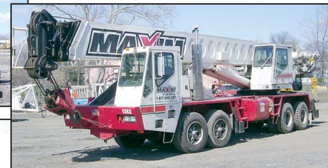
#1362 '91 LINK-BELT HTC840