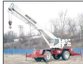
#1098 '88 LINK-BELT HSP8030

GROVE Model RT65S, 35 Ton Hydraulic Rough Terrain Crane, s/n 39706, powered by Detroit diesel engine and hydraulic drive, equipped with 34'-104' 4-section boom with 23' power pin fly, 32' swingaway jib, single drum, hook block and ball, (4) hydraulic outriggers, and 23.5x25 tires. In fair to good condition with fair to good tires.