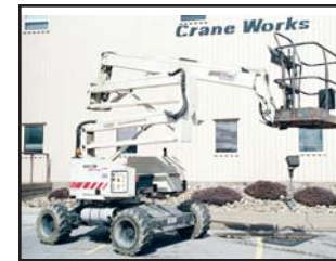
#A1669 '99 TEREX TA50RT

#A1669 1999 TEREX Model TA50RT, 50' 4x4 Aerial Lift, s/n 15068, powered by 4 cylinder dual fuel LP/gas engine and hydraulic drive, equipped with man/material basket, 27"x72" platform, articulated boom, and 12x16.5 foam filled tires. In good condition with good tires. (Maxim)