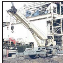
#260 '90 P&H CN150

(3) 1993 P&H Model CN150, 50 Ton Hydraulic Rough Terrain Cranes, s/n 56592 ( #901 ); s/n 56745 ( #904 ); s/n 56767 ( #908 ), powered by Cummins 8.3L diesel engine and powershift transmission, equipped with 35'-110' 4-section boom with 25' power pin fly, 35'-60' telescopic swingaway jib, main and auxiliary hoists, LMI system, Kruger anti-two block system, (4) hydraulic outriggers, and 26.5x25 tires. In good condition with good tires. (Maxim)