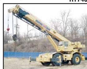
#264 '89 GROVE RT745

#264 1989 GROVE Model RT745, 45 Ton Hydraulic Rough Terrain Crane, s/n 72319, powered by Cat 3208 diesel engine and powershift transmission, equipped with 34'-104' 4-section boom with 23' power pin fly, 32'-56' telescopic swingaway jib, main and auxiliary hoists, LMI system, anti-two block system, (4) hydraulic outriggers, and 29.5-25 tires. In good condition with good tires. (Maxim)