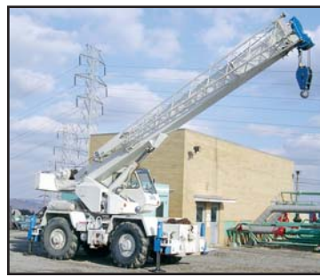
#249 '87 P&H OMEGA 122

#249 1987 P&H Model Omega 122, 22 Ton Hydraulic Rough Terrain Crane, s/n 54216, powered by Detroit V-8 diesel engine and powershift transmission, equipped with 29'-72' 3-section hydraulic boom, 25' swingaway jib, single hoist, PAT anti-two block system, (4) hydraulic outriggers, and 16.00-24 tires. In good condition with good tires. (Maxim)