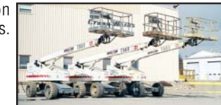
#A1617 '99 TEREX TB60

(4) 1999 TEREX Model TB60, 60' 4x4 Aerial Lifts, s/n 98630326 ( #A1649 ); s/n 99630130 ( #A1618 ); s/n 99630035 ( #A1583 ); s/n 99630121 ( #A1617 ), powered by Cummins B3.9-C diesel engine and hydraulic drive, equipped with 600# capacity man/material basket, 36"x96" platform, 51' horizontal reach, and 15x19.5 foam filled tires. In good condition with good tires. (Maxim)