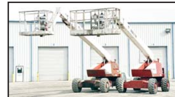
#A496 & #A442 (2) '95 SNORKEL PRO-66RDZ's

(2) 1995 SNORKEL Model PRO-66RDZ, 66' 4x4 Aerial Lifts, s/n 9527350895 ( #A496 ); s/n 9501980495 ( #A442 ), powered by Deutz 4 cylinder diesel engine and hydraulic drive, equipped with 500# capacity man/material basket, 30"x92" platform, 56' horizontal reach, and 15x19.5 foam filled tires. In good condition with good tires. (Maxim)