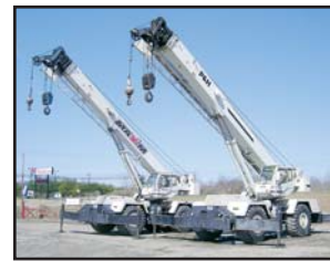
#109 & #259

(3) 1993 P&H Model CN150, 50 Ton Hydraulic Rough Terrain Cranes, s/n 56592 ( #901 ); s/n 56745 ( #904 ); s/n 56767 ( #908 ), powered by Cummins 8.3L diesel engine and powershift transmission, equipped with 35'-110' 4-section boom with 25' power pin fly, 35'-60' telescopic swingaway jib, main and auxiliary hoists, LMI system, Kruger anti-two block system, (4) hydraulic outriggers, and 26.5x25 tires. In good condition with good tires. (Maxim)