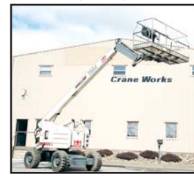
#A1524 '99 TEREX TA64

#A1524 1999 TEREX Model TA64, 64' 4x4 Aerial Lift, s/n 99230037, powered by Continental 4 cylinder diesel engine and hydraulic drive, equipped with 500# capacity man/material basket, 36"x96" platform, 52' horizontal reach, articulated boom, and 15x19.5 foam filled tires. In good condition with good tires. (Maxim)