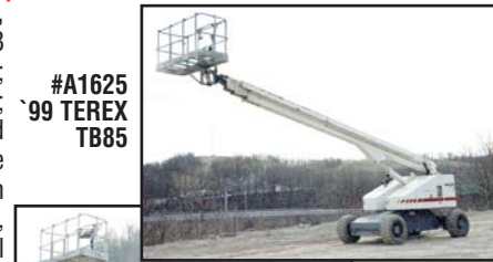
#A1625 '99 TEREX TB85

(4) 1999 TEREX Model TB85, 85' 4x4 Aerial Lift, s/n 99660078 ( #A1626 ); s/n 99660076 ( A1625 ); s/n 99660065 ( #A1568 ); s/n 99660057 ( #A1565 ), powered by Cummins B3.9-C diesel engine and hydraulic drive, equipped with 500# capacity man/material basket, 36"x96" platform, 70' horizontal reach, and 15x19.5 foam filled tires. In good condition with good tires. (Maxim)