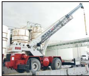
#296 '91 LINK-BELT HSP8050

#296 1991 LINK-BELT Model HSP8050, 50 Ton Hydraulic Rough Terrain Crane, s/n 5311-223, powered by Detroit 6V-71 diesel engine and powershift transmission, equipped with 35'-110' 4-section boom with 25' power pin fly, 33' swingaway jib, main and auxiliary hoists, LMI system, anti-two block system, (4) hydraulic outriggers, and 29.5x25 tires. In good condition with good tires. (Maxim)