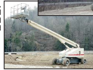
#A1565 '99 TEREX TB85

#A638 1996 JLG Model 80HX+6, 86' 4x4 Aerial Lift, s/n 0250720300024643, powered by Deutz 4 cylinder diesel engine and hydraulic drive, equipped with man/material basket, 36"x72" platform, 77' horizontal reach, extendable axles, and 15x19.5 foam filled tires. In good condition with good tires. (Maxim)