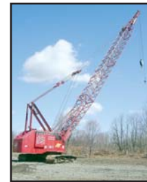
#127 MANITOWOC 3900