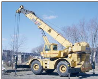
#952 '91 GROVE RTG35

#2273 1991 GROVE Model RT740B, 40 Ton Hydraulic Rough Terrain Crane, s/n 75470, powered by Cummins 6 cylinder diesel engine and powershift transmission, equipped with 35'-110' 4-section hydraulic boom, 32'-56' telescopic swingaway jib, PAT DS350GW LMI system, anti-two block system, (4) hydraulic outriggers, and 23.5R25 tires. In good condition with good tires. (Maxim)