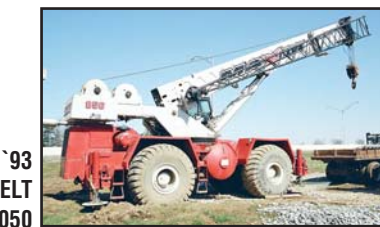
#856 '93 LINK-BELT HSP8050

#856 1993 LINK-BELT Model HSP8050, 50 Ton Hydraulic Rough Terrain Crane, s/n 5313-101, powered by Cummins 8.3L diesel engine and powershift transmission, equipped with 35'-110' 4-section boom with 25' power pin fly, 33' swingaway jib, main and auxiliary hoists, Radio 959 LMI system, (4) hydraulic outriggers, and 29.5x25 tires. In good condition with good tires. (Maxim)