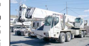
#1049 '94 LINK-BELT HTC835