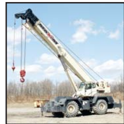
#904 '93 P&H CN150