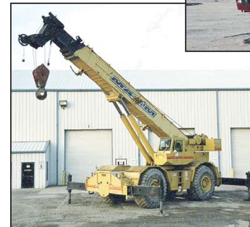
#8399 '92 GROVE RT990