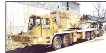
#8467 '93 GROVE TMS875B (BOOM DOLLY - NOT INCLUDED)