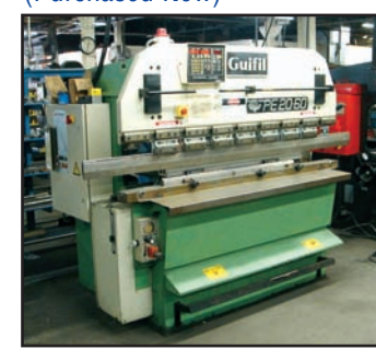
'93 GUIFIL PE20-60

1995 AMADA Model RG-50, 50 Ton Hydraulic Press Brake , s/n 50508902, equipped with 78.8" bed, 59.9" between uprights, 15.76" throat depth, 3.94" stroke length, 14.58" open height, (10) punch holders, and Amada NC9-EX II back gauge controls. In good condition. (Purchased New)