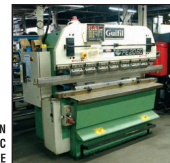
'93 GUIFIL 66 TON HYDRAULIC PRESS BRAKE