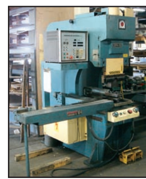
'85 AMADA SPH-30C

1985 AMADA Model SPH-30C, 30 Ton Hydraulic Punch/Brake Press , s/n 308909, equipped with C-type frame, bending and punching capability, 20.1" throat, 15.4" between uprights, 3.94" stroke length, 20.5" open height, 16"x28" T-slot table, punch holders, (2) foot pedal controls, Amadan-SS 104 8"x50" power feed table, and Amadan-SS System II NC controls. In good condition. (Purchased New)