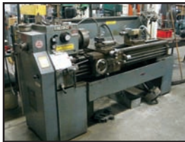
LEBLOND ENGINE LATHE

DOALL Model 1612-0, 16" Vertical Band Saw , s/n 277-721218, powered by 7.5HP electric motor, equipped with variable blade speed, 125" band length, 24"x24" tilting table, and DBW-15 blade welder/grinder. In good condition.