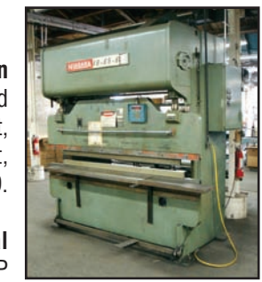
NIAGRA 65-100 TON MECHANICAL

1993 GUIFIL Model PE20-60, 66 Ton Hydraulic Press Brake , s/n 013436, equipped with up-acting 80" bed, 60" between uprights, 16" throat, 3.9" stroke, (9) universal punch holders, and Automec CNC 1000/G24 back gauge, s/n 03944964. In good condition. (Purchased New)