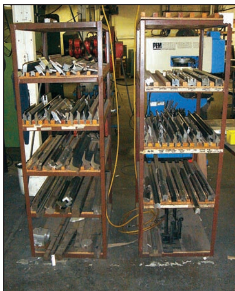
EUROPEAN PRESS BRAKE DIES