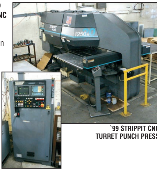
'99 STRIPPIT CNC TURRET PUNCH PRESS

1999 STRIPPIT/LVD Model 1250H/20 CNC Turret Punch Press , s/n 073120699, equipped with 23 ton punching capacity, 20-station turret, (2) auto indexing stations, 62"x87" roller ball table, manual clamps and G.E. Fanuc Series 0-PC CNC controls, s/n 3000010213. In good condition. (Purchased New)