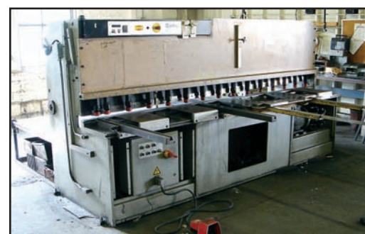
DARLEY HYDRAULIC SHEAR