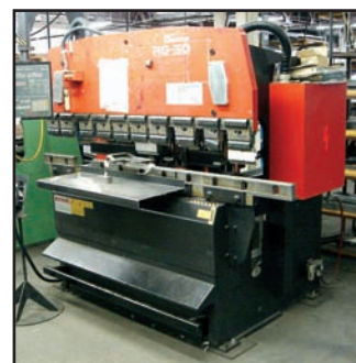
'95 AMADA 50 TON HYDRAULIC PRESS BRAKE