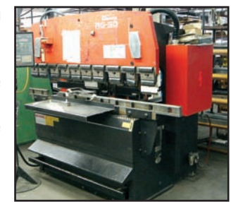
'95 AMADA RG50

1993 GUIFIL Model PE20-60, 66 Ton Hydraulic Press Brake , s/n 013436, equipped with up-acting 80" bed, 60" between uprights, 16" throat, 3.9" stroke, (9) universal punch holders, and Automec CNC 1000/G24 back gauge, s/n 03944964. In good condition. (Purchased New)