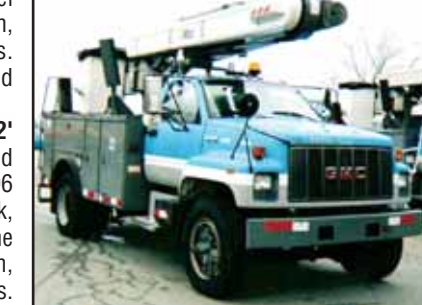
(1) OF (2) `96 ALTEC 42'

(2) 1996 ALTEC Model LR42, 42' Aerial Lifts, s/n 0996BG0122 and s/n 0896BG011, mounted on 1996 GMC Topkick Single Axle Truck, powered by Cat 3116 diesel engine and automatic transmission, equipped with 256/80R22.5 tires. In good condition with good tires.