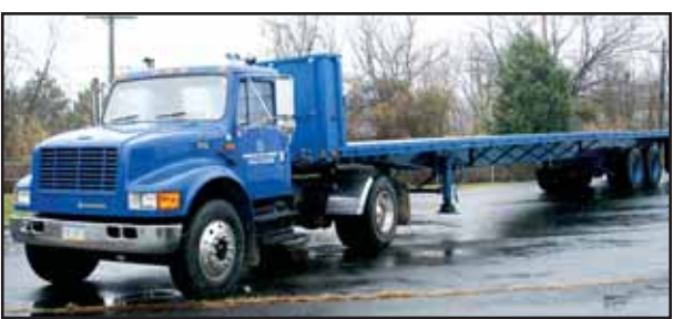
`96 INT'L AND `89 TRAILMOBILE 48'