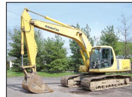
'98 KOMATSU PC200LC-6