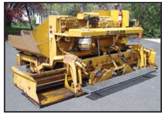
'96 MAULDIN 550E

1996 MAULDIN Model 550E Crawler Paver , s/n 559603110, powered by Kohler 23HP gas engine and hydrostatic transmission, equipped with 8'-13' heated vibratory screed, 9" augers, and wash down system. In good to very good condition with good to very good undercarriage (SLATER)