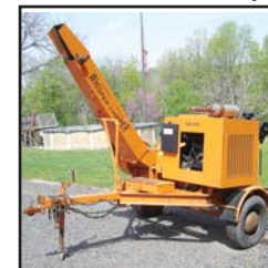
ALTEC PORTABLE CHIPPER

1986 INGERSOLL RAND 100CFM Gas Powered Air Compressor , (CVA) • 1989 INGERSOLL RAND 100CFM Gas Powered Air Compressor , (Parts - Engine Good - Missing Air End) (CVA) • (2) 6"x6" Diesel Powered Centrifugal Pumps (CVA)