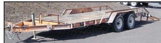
'99 HUDSON 5 TON

1999 HUDSON 5 Ton Tandem Axle Tag-A-Long Trailer , equipped with 16'x6' 6" level deck with 2' beavertail, 5' ramps, electric brakes, and ST205/75R15 tires. In good condition with good tires.