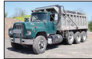
'83 MACK RD686S

1983 MACK Model RD686S Tri-Axle Dump Truck , powered by Mack EM6-300, 300HP diesel engine and 6 speed lo-hole transmission, equipped with Summit 17' aluminum dump body with power tarp, 44,000# rears, 18,000# front axle, 2-position Jake brake, 12R24.5 front and lift tires, and 11R24.5 rear tires. In good condition with good to very good tires. (BACHMAN)