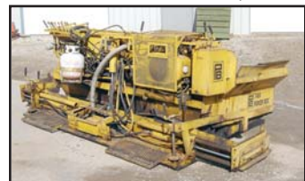
PUCKETT BROS T450

2004 VIBROMAX Model W365 Vibratory Tandem Roller , s/n JKC4001901, powered by Kubota 4 cylinder diesel engine and hydrostatic transmission, equipped with 55" smooth drums, water system with front and rear spray heads, and roll bar. In very good condition. (0,051 Original Hours)