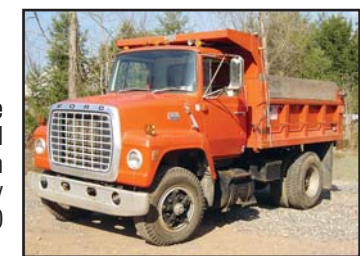
'78 FORD LN8000