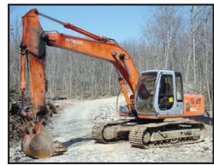
'98 HITACHI EX160LC-5

1998 HITACHI Model EX160LC-5 Hydraulic Excavator , s/n 13KP001501, powered by Isuzu diesel engine and hydraulic drive, equipped with 8'6" dipper stick with Geith 18" mechanical thumb attachment, 42" digging bucket, 24" TBG pads, and 12'10" crawlers. In fair to good condition with fair to good undercarriage.