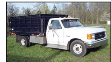
'87 FORD F-350

FORD Model 9000 Tandem Axle Dump Truck , powered by Cummins 290HP diesel engine and Fuller 13 speed transmission, equipped with 13' dump body. (Off Road Use) (BACHMAN)