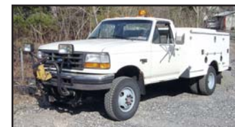
'94 FORD F-350XL, 4X4

1997 FORD Model F-350XL, 4x4 Mechanics Truck , powered by Powerstroke 7.3L diesel engine and 5 speed transmission, equipped with Omaha 8' mechanics body with 100 gallon fuel tank with 12 volt pump, ladder rack, air conditioning, tow package, and LT285/75R16 tires. In good condition with good tires.