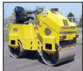
'04 VIBROMAX W102