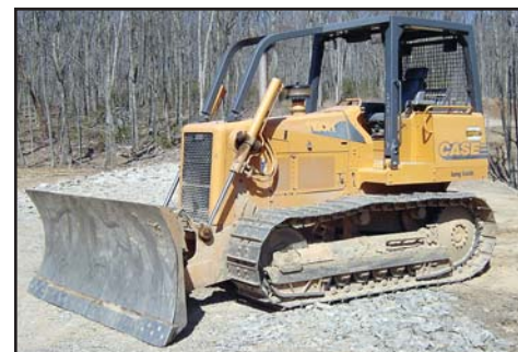
'00 CASE 1150H

Telford, Pennsylvania (Philadelphia/Allentown Area)