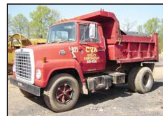
'85 FORD F-700

1988 CHEVROLET Model C30, 4x4 S/A Dump Truck , powered by V-8 gas engine and 4 speed transmission, equipped with 8' dump body with cab protector and single chute, Myers 8' snowplow, tow package, dual rear wheels, and 235/85R16 tires. In good condition with good tires. (New Clutch and Pressure Plate, Flywheel, Brakes - Fall 2005) (RITTENBAUGH)