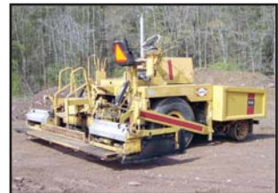
BLAW KNOX PF-115

BLAW-KNOX Model PF-115 Rubber Tired Paver , s/n 0769-019, powered by John Deere diesel engine and hydrostatic transmission, equipped with Fortress model 600A 8'-14' vibratory screed, steering assist, single steering bogie, and G-20xZA tires. In good condition with good tires. (CAPECE)