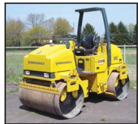
'04 VIBROMAX W365

HUBER Model T-810-H Static Tandem Roller , s/n 5T2928, powered by 4 cylinder gas engine and hydrostatic transmission, equipped with 50" front split and rear drums, water system with front and rear spray, and drum cleaners. In good condition. (CAPECE)