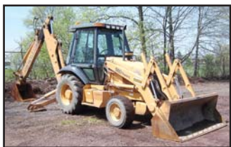
'00 CASE 580 SUPER L 4X4

2000 CASE Model 580 Super L, Series 2, 4x4 Tractor Loader Extend-A-Hoe , s/n JGG0277515, powered by Case diesel engine and shuttle transmission, equipped with general purpose loader bucket with bolt-on cutting edge, 30" digging bucket, enclosed ROPS cab with air conditioning, and 12x16.5NHS front and 19.5x24 rear tires. In good condition with fair to good tires.