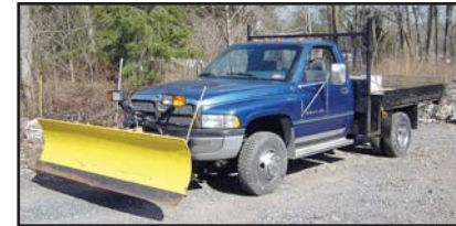
'95 DODGE 3500SLT, 4X4

1995 DODGE Model Ram 3500SLT, 4x4 Flatbed Truck , powered by Magnum V-10 gas engine and 5 speed transmission, equipped with 10'6" flatbed welders body with headache rack, Myers 7'6" snowplow, dual rear wheels, air conditioning, AM/FM cassette, and 215/85R16 tires. In good condition with good tires. (SLATER)