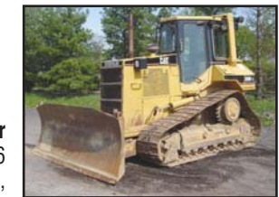
'98 CAT D5M XL

1998 CATERPILLAR Model D5M XL Crawler Tractor , s/n 6GN01030, powered by Cat 3116 diesel engine and powershift transmission, equipped with 6-way hydraulic straight blade, fingertip controls, enclosed ROPS cab with heat and air conditioning, and drawbar. In good condition with fair to poor undercarriage. (GECC)