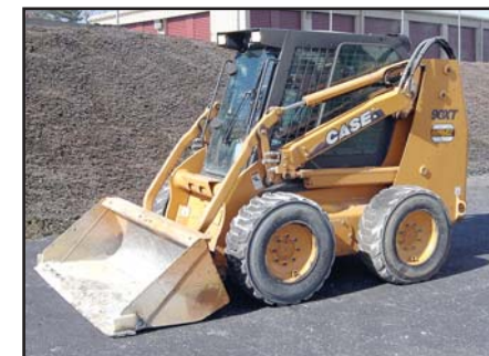
'04 CASE 90XT