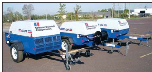
PORTABLE AIR COMPRESSORS

1440 COWPATH RD. • HATFIELD, PA 19440 215/361-9099 • Fax: 215/361-9212