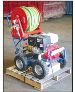
ELECTRIC EEL 3000

Plumbing: ELECTRIC EEL 3000 Sewer Jetting Machine, Honda 13HP • LARGE QUANTITY BRASS CRAFT Plumbing Hand Tools, & Hardware