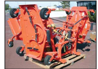
12' GANG MOWER