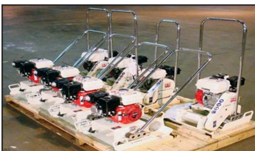
VIBRATORY PLATE COMPACTORS

(10) Vibratory Plate Compactors and (2) Demolition Saws: (3) TEREX BARTELL B1824-H, Honda 5.5HP • (4) TEREX BARTELL B1821-H, Honda 5.5HP • TEREX BARTELL B1318, Honda 4HP • (2) STONE SFP4000 and SFP5100 • (2) Gas Powered Demolition Saws