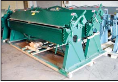
10' HAND BRAKES