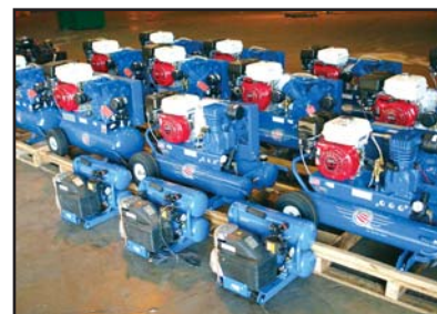
(19) JOBSITE AIR COMPRESSORS

(1) Automatic Emergency Standby Generator (Day 1): BALDOR AE25-E-NG, 25KW, 120/240 VAC, 104.2 amp, 1-Ph, ASCO 300 auto-transfer switch, Ford 40HP Natural Gas (19) Portable Generators (Day 2): (7) GILLETTE 15,000 Watt to 6,500 Watt, gas 25HP to 13HP, electric starts • (3) BALDOR 11,000 Watt to 6,000 Watt • (7) WINCO 10,800 Watt to 5,000 Watt (1 Used) • (2) ROBIN 5,500 Watt and 6,800 Watt