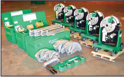
CAM TRACK & QUAD BENDERS