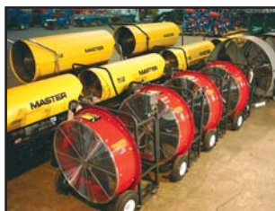
HEATERS & POWER BLOWERS

(30) MASTER & HEAT STAR Kerosene Torpedo Heaters: (10) 600,000BTU • (2) 400,000BTU • (4) 350,000BTU • (4) 210,000BTU (1 Used) • (4) 200,000BTU • (15) Stainless Steel Patio Heaters, propane (8) TEMPEST 24" Power Blowers, electric • (4) MOPECO 8" Power Blowers, Honda 5HP • (5) MOPECO 8" Power Blowers, electric • (4) TPI 36" Direct Drive Blowers, electric