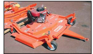
SELF POWERED 60"