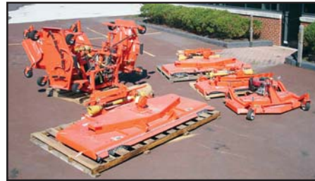
FINISH MOWER ATTACHMENTS

(4) TORWEL Economizer Gas Powered Salt Spreaders: (2) 1.7 cu.yd., (1) 2.5 cu.yd., & (1) 4.0 cu.yd., all with headboard, cab controls, B&S 8HP (2,000+/-) 20# Bags POLAR EXPRESS Ice Melt • (150+/-) 3 gal Pails SPRAY N' MELT SALT SPREADERS