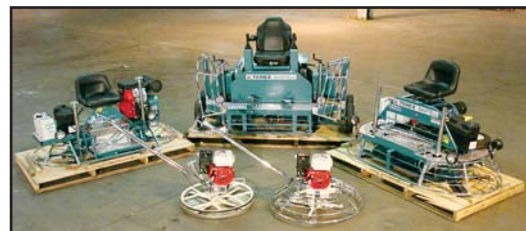
CONCRETE FINISHING TROWELS