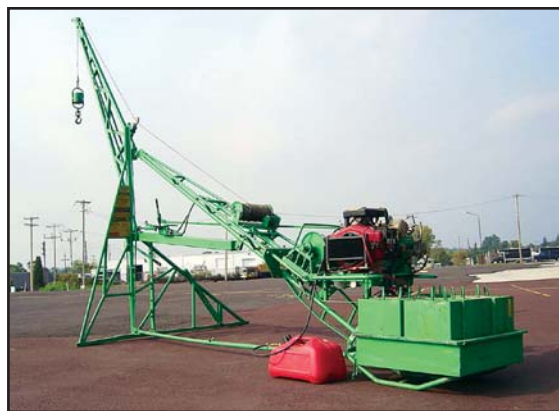
GARLOCK 2,000# ROOFTOP HOIST

(10) Roof Top Hoists and Attachments: RGC HS200P, 2,000# swing hoist, hydraulic winch, Vanguard 18HP • GARLOCK , 2,000# hydraulic hoist (Used) • HI-TECH HOIST Patriot 2000, 2,000# cable hoist, I-beam roller kit, 3HP electric • RGC SH300, 300# hand swing hoist • (3) GARLOCK , 300# hand hoist, counterweights (Used) • (3) CM 360 Hurricane, 20' & 12' hoists • RGC Trash Tray, cable assembly • (3) RGC HF2000, 2,000# Hoisting Forks • (2) RGC HF1000, 1,000# Hoisting Forks • (3) RGC GB1600, 1,600# Gravel Buckets, 14 cu.ft. • (3) RGC GB800, 800# Gravel Buckets, 7 cu.ft. • AEROIL 400# Rock Bucket (Used) • (3) Power Ladder Platform Hoists and Attachments: (3) RGC 400 Pro-HG, 400#, 16', 18', & 44', gas • RGC Plywood Carrier, Gravel Hopper Assembly, and Scaffold Support Arm