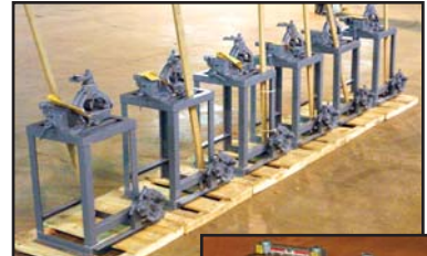
ANGLE IRON SHEAR-NOTCHER-BENDERS

(14) TENNSMITH & ROPER WHITNEY 10' Floor Model Hand Brakes: (1) 14 gauge; (5) 16 gauge; (8) 18 gauge (1 Used)