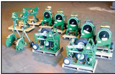
GREENLEE BENDERS AND CABLE FEEDERS

(3) 881CT Cam Track • (2) 855 Smart Quad • (2) 854 Quad • 853 Quad • (4) 555 • 555-C Classic • (2) 1818 Manual Benders • (3) 1813 Bending Tables (fits 881) • (2) Attachment Sets, 1/2" to 2", EMT (fits 555)