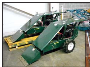
REEVES ROOF RIPPERS

(2) Rippers and (12) Cutters: (2) REEVES Twister Roof Rippers, hydraulic drive, 21" blade, Kohler 10HP w/elect start • REEVES Twin Blade Hydraulic, Kohler 20HP w/elect start • (4) GRIZZLY 303700 Piranha, Honda 18HP • ROOF MASTER Single Blade, Honda 9HP • REEVES Single Blade, Honda 11HP • (2) CLEASBY Single Blade, Honda 5.5HP (Used) • REEVES Single Blade, 9HP • (2) REEVES Mighty Mini, Honda 5.5HP (1 Used)