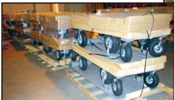
DRYWALL CARTS & PALLET JACKS