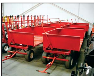
TRASH DUMP TRAILERS

(6) Power and (6) Trailer Trash Tray Dump Hoppers: ALL SEASONS 105600 Hydraulic Work Horse, trash tray dump attachment, 9HP • (2) CLEASBY Power King, trash tray dump attachment, Honda 5.5HP • (2) GRIZZLY 33000 Work Horse, trash tray dump attachment, Honda 9HP • (6) HILCO Big Boss Trash Tray Dump Trailers, wagon steer