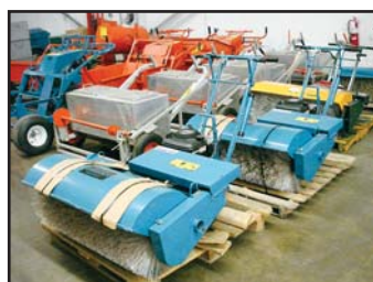
POWER BROOMS & FELT LAYERS

(5) Power Brooms: (4) GRIZZLY 36", B&S 5HP • REEVES 36", B&S 5.5HP