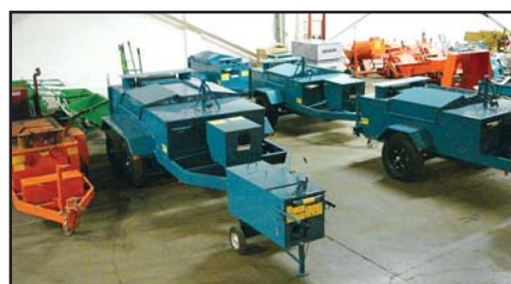
PUMPER & DRAW KETTLES

(10) Roof Top Hoists and Attachments: RGC HS200P, 2,000# swing hoist, hydraulic winch, Vanguard 18HP • GARLOCK , 2,000# hydraulic hoist (Used) • HI-TECH HOIST Patriot 2000, 2,000# cable hoist, I-beam roller kit, 3HP electric • RGC SH300, 300# hand swing hoist • (3) GARLOCK , 300# hand hoist, counterweights (Used) • (3) CM 360 Hurricane, 20' & 12' hoists • RGC Trash Tray, cable assembly • (3) RGC HF2000, 2,000# Hoisting Forks • (2) RGC HF1000, 1,000# Hoisting Forks • (3) RGC GB1600, 1,600# Gravel Buckets, 14 cu.ft. • (3) RGC GB800, 800# Gravel Buckets, 7 cu.ft. • AEROIL 400# Rock Bucket (Used) • (3) Power Ladder Platform Hoists and Attachments: (3) RGC 400 Pro-HG, 400#, 16', 18', & 44', gas • RGC Plywood Carrier, Gravel Hopper Assembly, and Scaffold Support Arm