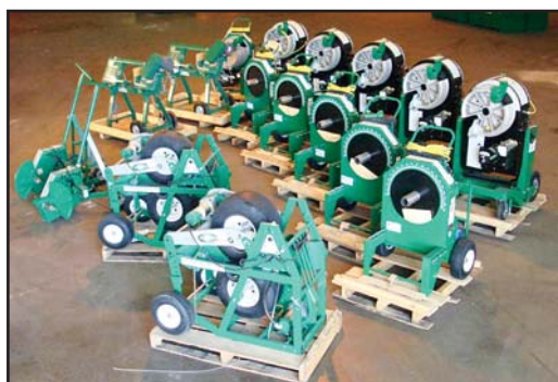
GREENLEE BENDERS & CABLE FEEDERS

PRE-SORTED FIRST CLASS MAIL US POSTAGE PAID HAVERTOWN, PA PERMIT #45