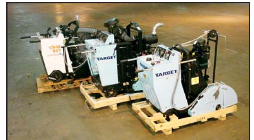
DIESEL CONCRETE SAWS

(12) Walk-Behind Concrete Saws: TARGET: PRO 6636, JD 66HP Turbo diesel, 36" • PRO 35 III, Deutz 31HP diesel, 26" • Econoline II, Honda 24HP • PAC IV, Honda 20HP, 20" • MC18, Honda 13HP, 18" • PC18, Honda 13HP, 18" • MG-8-4H, Honda 4HP, 8" • (2) CORE CUT: CC6560-XLS, Deutz 60HP diesel, 36" • CC2500, Honda 24HP • (3) NED-KUT: PX35W, Wisconsin 35HP • PX20H, Honda 20HP • MCX-13H, Honda 13HP • (70) Diamond Saw Blades, 36" to 8"