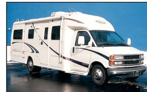
'02 CHEVY TRAIL-LITE

1440 COWPATH RD. • HATFIELD, PA 19440 215/361-9099 • Fax: 215/361-9212