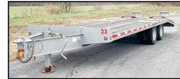
'91 INTERSTATE 12 TON

2005 AMERICAN HAULER Model FD228, 7'x15'6" Single Axle Cargo • 2000 WINSTON Tandem Axle Tag-A-Long • 2002 KIEFER INDUSTRIAL 6 Ton Tandem Axle Tag-A-Long • 1991 INTERSTATE Model 20DT, 12 Ton Tandem Axle Tag-A-Long • (2) 1989 HURST 9 Ton Tri-Axle Tag-A-Long Trailers • 4x10, Tandem Axle Tag-A-Long Trailer • 8x26, Single Axle Office Trailer