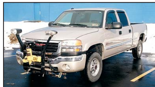
'04 GMC 2500SLE HD 4X4

PRE-SORTED FIRST CLASS MAIL US POSTAGE PAID HAVERTOWN, PA PERMIT #45