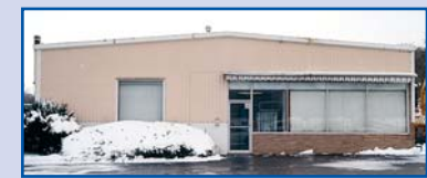
27-4,900 SQ FT OFFICE-SHOP BUILDING

To Be Offered "Subject To Owner's Immediate Confirmation" (To Be Sold At Approximately 12:00PM)