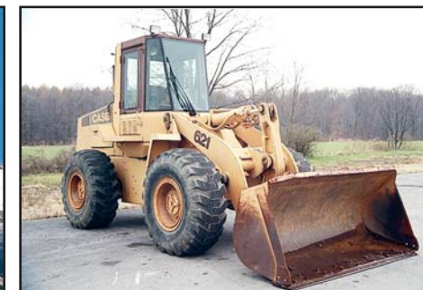
'89 CASE 621