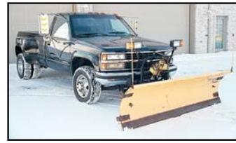
'92 CHEVY 3500 4X4

1992 CHEVROLET Model 3500 Silverado, 4x4 Pickup Truck , powered by 6.5 liter diesel engine and automatic transmission, equipped with 8' bed, Meyers 8' snowplow with hydraulic angle, approximately 100 gallon fuel tank with 12 volt pump, 5th wheel hitch, power windows and locks, cruise control, air conditioning, dual wheels, and 225/75R16 tires. In good condition with good tires.