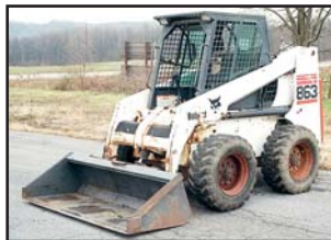
'97 BOBCAT 863

SKID STEER ATTACHMENTS: MB LP 5' Hydraulic Broom, s/n 140153, with hydraulic dumping hopper • 73" and 66" Buckets • THOMAS B203/U-2032, 70" Hydraulic Angle Plow Attachment, s/n 214386 • BOBCAT 42" Fork Attachment • INTERNATIONAL 20" Hydraulic Cold Planer CATERPILLAR Model V50B, 5,000# Pneumatic Tired Forklift , s/n 79M3625, powered by 4 cylinder propane engine and hydrostatic transmission, equipped with 157" 3-stage mast with tilt, 42" forks, adjustable operator protection, light package, 7.00x15 front and 6.50x10 rear tires. In good condition with good tires.