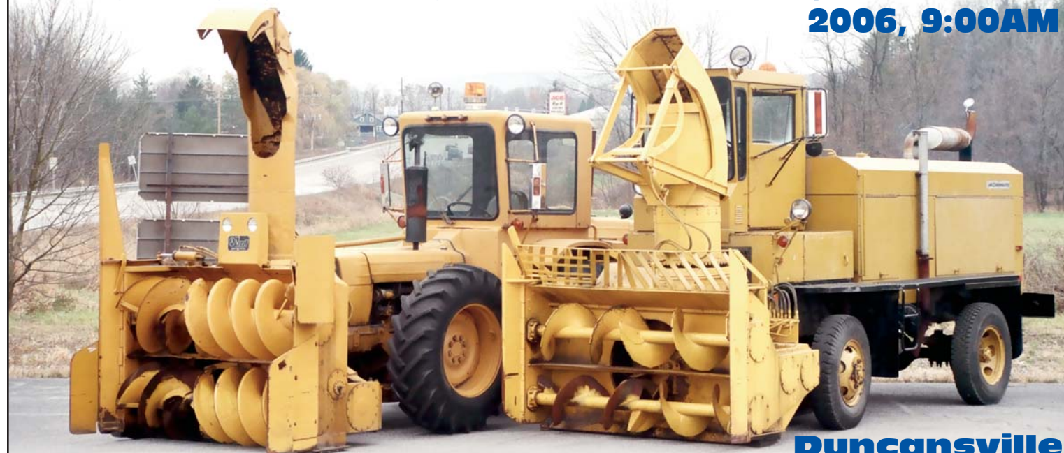
SMI AND VOHL SNOW BLOWERS