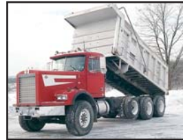
'85 DIAMOND REO

'99 FORD F350XLT 4X4 mirrors, air conditioning, and 235/85R16 tires. In good to very good condition with good tires.